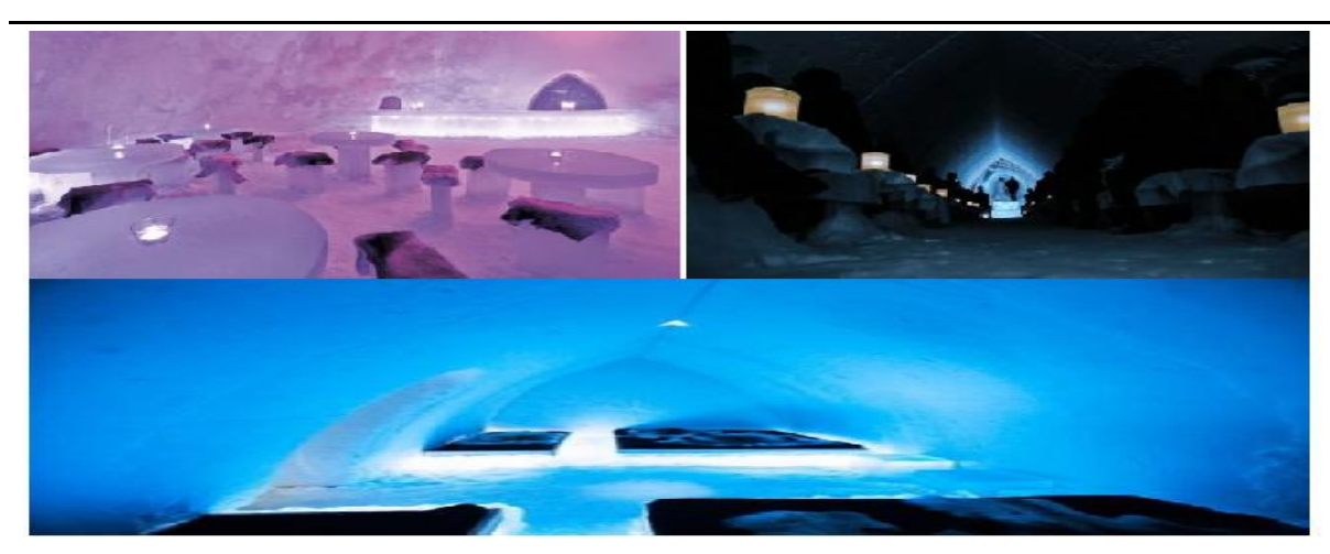
Ice bar, Ice Chapel, and family room (Arctic Snow Hotel, 2017)