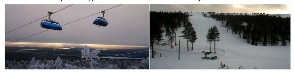
Ski lifts and Pistes (Levi Ski Resort, 2017)

Created in 1964, Levi Ski Resort gradually became known as Finland's fastest growing ski area in the country. Skiing season lasts October to May as the longest in the country. The upper slopes contain accumulated snow of 85 cm deep and 80 cm for lower slopes (Snow Magazine, 2016). Nearly 50 slopes consisting of more than 25 lifts (operating 10 am to 8 pm) with a capacity to uplift more than 27,000 people per hour; cross-country tracks of 230km of which 28km are illuminated for night skiing; a snow park which constitutes jumps, boxes, rails, and hits. In 2004, the first ever Ladies World Cup event in Finland was hosted by the Levi Ski Resort and followed by the 2006 hosting of the Men's World Cup which upgraded the resort's status to World Cup standards.