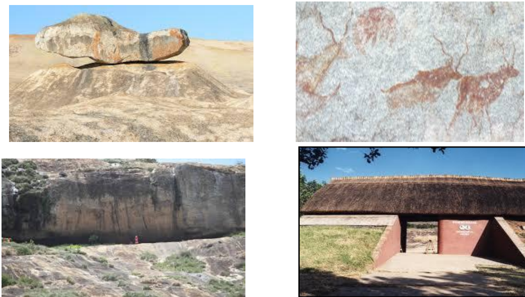
Figure2. Domboshava National Monument

Domboshava National Monument is located 35 km from Harare, the capital city of Zimbabwe. Domboshava National Monument was declared a National Monument in 1936 (Pwiti & Mvenge, 1996) and it is under the management of the National Museums and Monuments of Zimbabwe (NMMZ). The Monument house rock paintings and the rock paintings are found in a rockshelter on the eastern base of an extensive and imposing granite hill as shown in Figure 2 below. The hill, located in the Chinamhora Communal Lands, commands a magnificent view of the surrounding country. Major attractions include an Interpretive Centre or Site Museum, beautiful rock art panels, geological formations and a natural scenic environment such as abundant wooded vegetation, peaceful flowing stream, pools and walking trails.