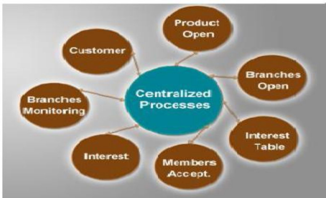
Figure 4. Architecture for Integrated Infrastructure of banking

Integration using a data center has helped a lot in improving and simplifying the network from the operations, user, cost perspective and administration perspectives are very effective. The integrated architecture is shown in the Figure 4.