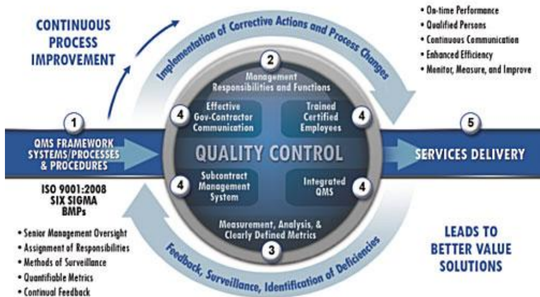
Figure 3. Architecture for Quality Assurance in Data Warehousing

The quality assurance in data mining architecture is shown in the Figure 3.