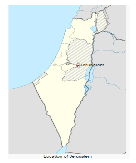
Fig1. Location of Jerusalem of Palestine

We indicated to data taken from the East Jerusalem (which occupied in 1967) with the knowledge that many of the areas have been taken over by Israel from 2000 and so far in Jerusalem. Data were used from the meteorological station in Jerusalem for the years 1993 to 2012, and for the same years for production of plant ( Table 1 ) and (Fig. 1). The bioclimatology of the aforementioned station was studied, and the value of the bioclimatic indices as annual ombrothermic index (Io), simple continentally index (Ic), and compensated thermicity index (It/Itc) and the climatic factors were obtained according to Salvador Rivas-Martinez [17-21].