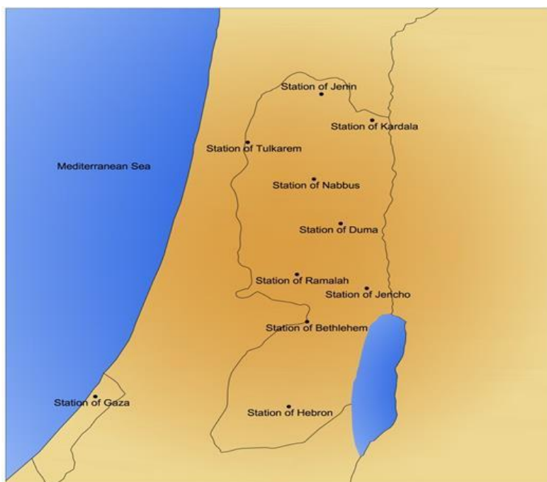
Fig1. Location of the meteorological Palestinian stations.

Data were used from the meteorological station in Jenin for the years 1993 to 2010 (17 years), ( Fig. 1 ) and for the same years for production of plant ( Table 1 ). The bioclimatology of the aforementioned station was studied, and the value of the bioclimatic indices as annual ombrothermic index (Io), simple continentally index (Ic), and compensated thermicity index (It/Itc) and the climatic factors were obtained according to Salvador Rivas-Martinez [17-21].