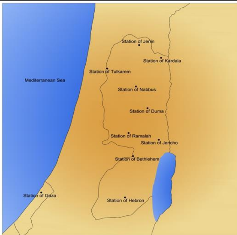
Fig1. Location of the meteorological Palestinian stations

Standardized traits mean values were used to perform principal component (PCA) and correspondence analysis (CA) using XLSTAT software. The goal of PCA is to decompose a data table with correlated measurements into a new set of uncorrelated variables. The results of the analysis are presented with graphs plotting the projections of the units onto the components, and the loadings of the variables. Correlation between variables was evaluated using Pearson's correlation coefficient [19].