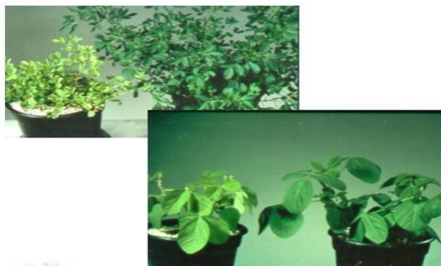
Figure 3. Sulfur Deficiency symptom

Sulfur deficiency is characterized by stunted growth, delayed maturity, and general yellowing of plants. Yellowed plants are also characteristic of nitrogen deficiency. However, unlike nitrogen deficiency which begins in the older leaves and progresses up the plant, sulfur deficiency symptoms