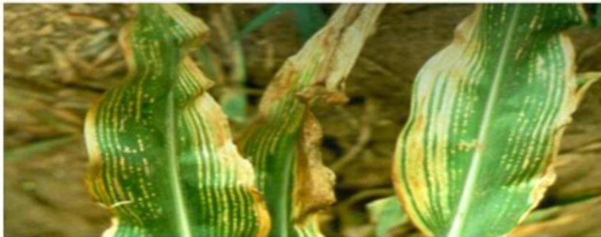
Figures5. Deficiency symptom Magnesium

Deficiency symptoms generally appear after topping when the plant is growing most rapidly. The symptoms are commonly referred to as “sand drown” since they occur most frequently on very sandy soils during periods of excessive rainfall. Magnesium deficiency occurs if soil pH is low or if only calcitic lime has been applied. Depending on the stage of growth and crop, magnesium deficiency can be corrected by soil application of lime or fertilizer. However, once a deficiency symptom has appeared, nothing can be done to correct the affected leaves. Application of a soluble magnesium fertilizer may prevent upper leaves from developing symptoms. Foliar applications of magnesium are effective in emergency situations where immediate response is required to salvage a crop. Usually, magnesium is applied to the soil through use of commercial fertilizers or dolomitic lime. Dolomitic lime sold in N.C. must contain a minimum of 6% Mg. However, some quarries guarantee as much as 9% Mg (M. Ray Tucker, 1999).