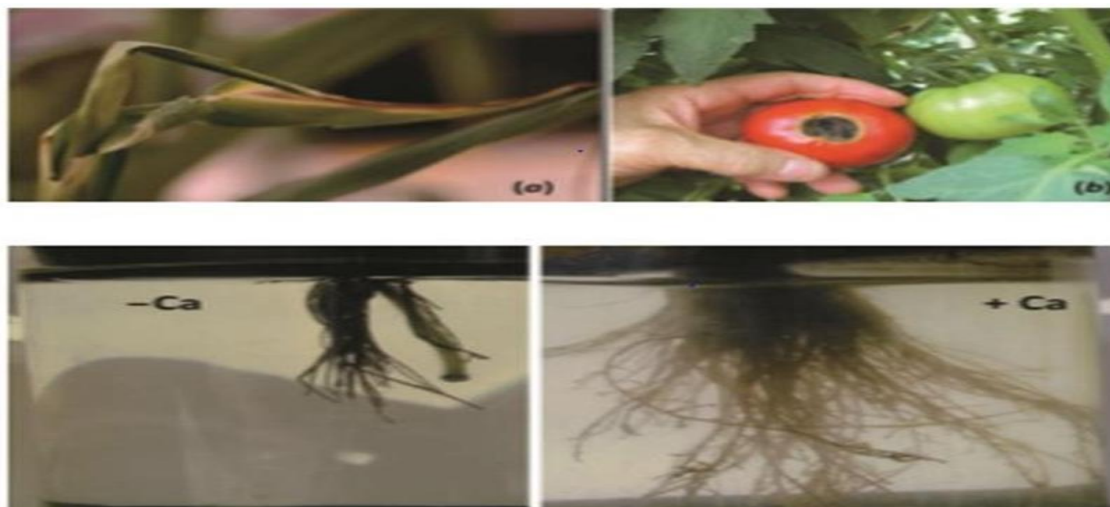
Figure4. Calcium deficiency symptom

Calcium has little toxic effects on plants. Most of the problems caused by excess soil Ca are the result of secondary effects of high soil pH. Excess Ca may cause reduced uptake of other nutrients such as P, K, Mg, B, Cu, Fe, and Zn (Khan Towhid Osman, 2013).