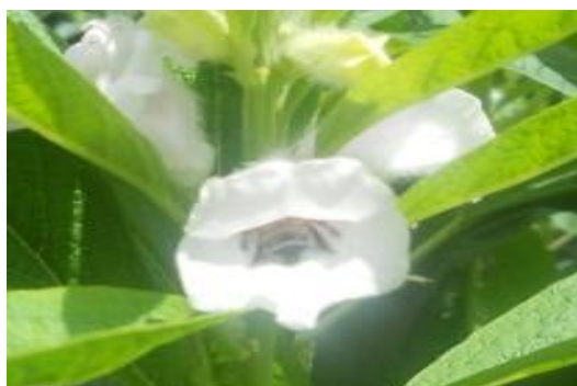
Figure2. Apis mellifera collecting nectar in a flower of Sesamum indicum

From our field observations, A. mellifera workers were found to collect pollen and to harvest nectar on S. indicum flowers (Figure 2). In 44 and 56 visits counted on flowers respectively in 2016 and 2017, 26 (59.09%) and 30 (53.57%) were for nectar collection, 11 (25.00%) and 17 (30.36%) for pollen collection, respectively in 2016 and 2017 (Table 2). For the total of 100 visits recorded during the two seasons, the number of visits allocated to nectar harvest was 56 (56.00%) and that for pollen collection was 28 (28.00%).