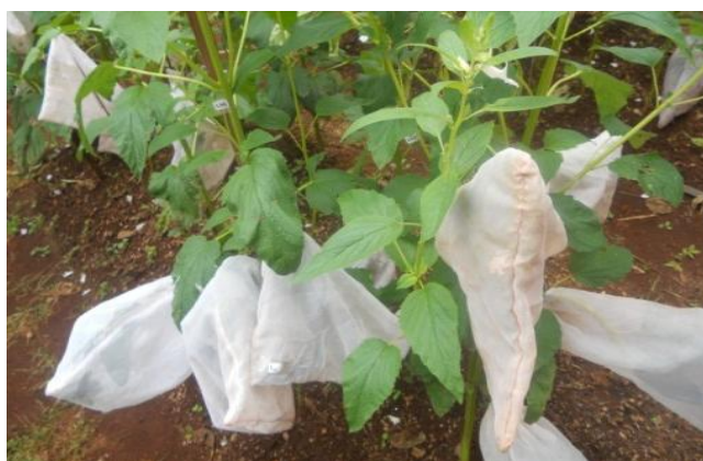
Figure1. Plants of Sesamum indicum showing flowers isolated from insects

In May 18 and May 23 respectively in 2016 and 2017, 90 flowers of S. indicum at the bud stage were labeled. Forty five of the total number flowers were allowed for treatment 1 (open pollination) and 45 others flowers belong to treatment 2 (bagged with gauze bags to prevent visitors or external pollinating agents) (figure 1). For each year, fifty days after the wilting of the last flower, the number of pod formed in each treatment was counted. For each treatment, the fruiting index ( Ifr ) was then calculated using the following formula: Ifr = (F1/F2) , where F1 is the number of pod formed and F2 the number of flowers initially labeled [16]. The out crossing rate ( TC ) was calculated using the formula: TC = \{[(Ifr_x - Ifr_y/Ifr_x)*100]\} , where Ifr x and Ifr y are mean fruiting indexes in treatments 1 and 2 respectively [17]. The rate of self-pollination in the broad sense ( TA ) was calculated using the formula: TA = (100 - TC) .