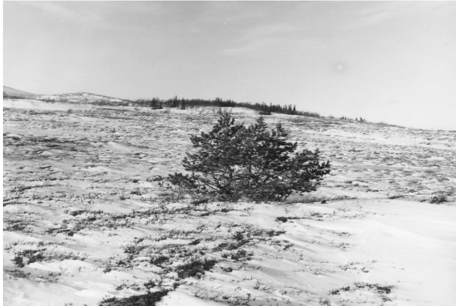
Fig. 20. The pine is multi-stemmed with a maximum of 2.1 m. The site is a wind-exposed and snow-poor mire landscape. No offspring is recorded in the near circumference. The age is at least 350 years, although a rotten center precludes absolute dating. Photo: 1978-03-22.