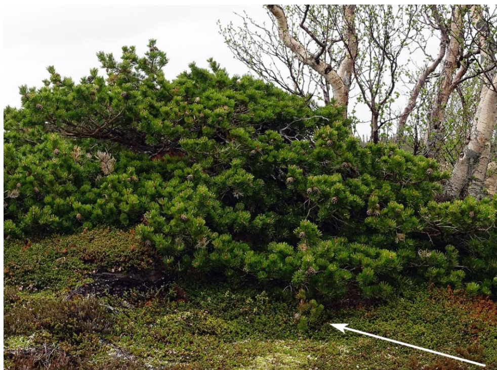
Fig. 19. In recent years, also this pine has produced some progeny (arrow) in its near circumference. Photo: 2017-06-10.