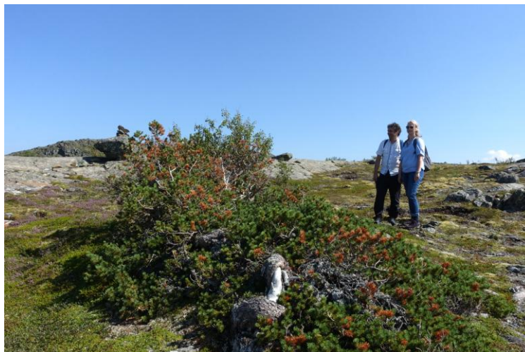
Fig. 6. Between 2017 (Fig. 5) and 2019, the pine has suffered some winter-desiccation injuries to shoots projecting above the snow cover. This is a kind of “bonsai” mechanism which has conserved the shape and longevity of this specific life-form. Photo: 2019-07-23.