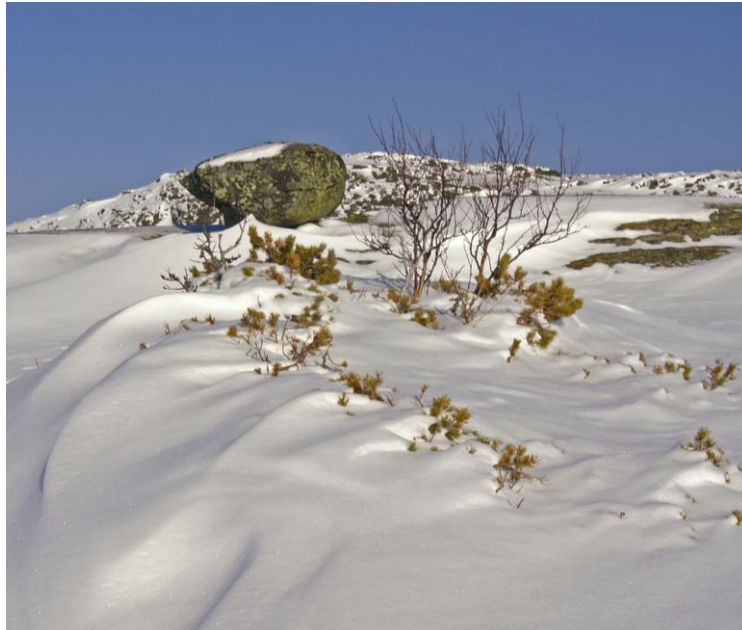
Fig. 8. The pine is largely protected by snow for long periods during the winter. Shoots protruding above the snow surface suffer winter-desiccation Photo: 2008-03-22.