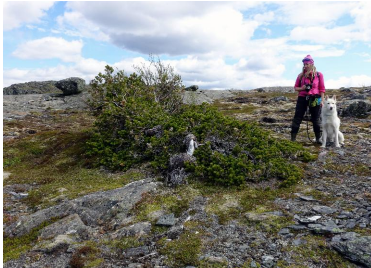
Fig. 5. Since the early 1970s, stature and density of the pine has increased. The maximum height is 2.1 m in 2019, which means that this a tree, according the adopted definition. Notably, also the sheltered birch in the background has gained in height.