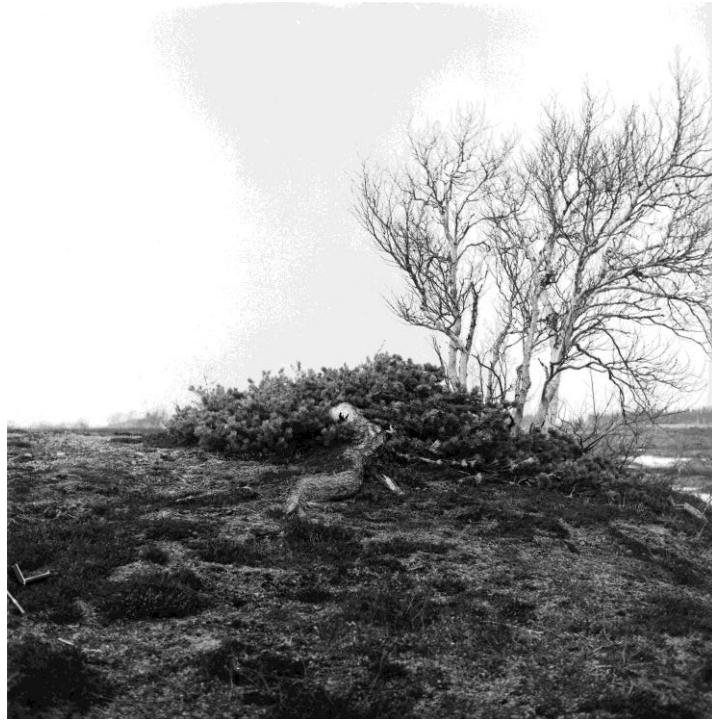
Fig. 11. This pine with its stout and prostrate main stem displays an extension of 3x3 m and a maximum living height of 0.5 m. One dead leader has been slightly more than 1 m high. Tree-ring counting indicates that the age is at least 350 years. Photo: 1977-05-06.