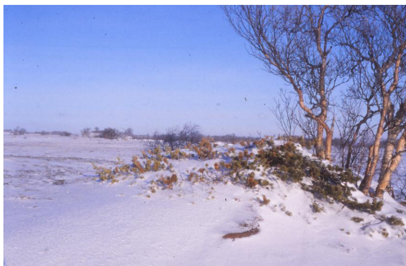
Fig. 16. Another severe winter imposed extensive needle desiccation and set back of canopy expansion. Photo : 1994-02-05.