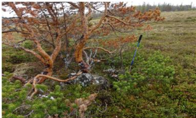
Fig. 22. Detailed view of the basal parts of the stem oldest stem, and a centrifugally spreading edging of layering stems with adventitious roots at a distance of 1-1.5 m. Compared to most of the stems, the oldest part of this clonal pine specimen is disproportionately thick.