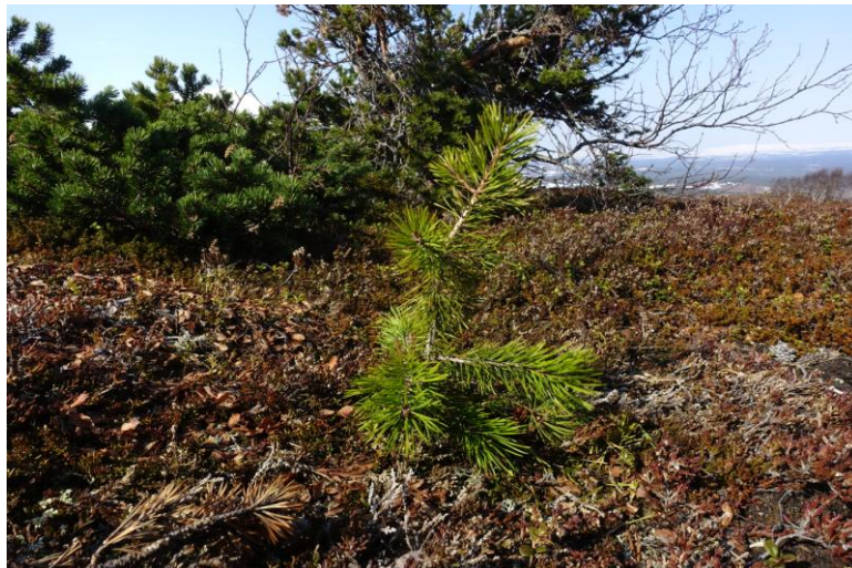
Fig. 9. Pine sapling established in a dense matrix of Calluna vulgaris in shelter of the krummholz pine. Photo: 2019-04-26.