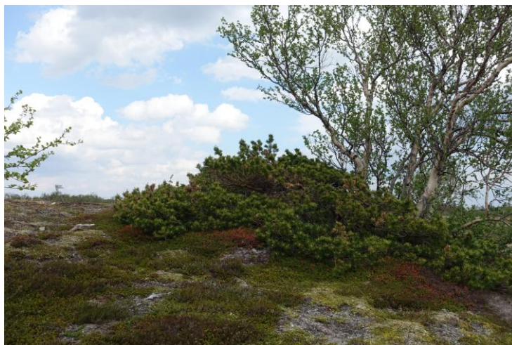
Fig. 18. Summer view of the concerned pine, to be compared with the initial image (Fig. 11), showing progressive transformation into near-tree stature. The total change of the ground cover since the early-1980s is eclatant. Photo: 2019-06-07.