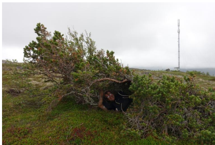
Fig. 10. The pine is composed of an intricate and dense network of interconnected stems, with adventitious roots and more less covered by plant debris. A large and entirely plant-free hollow appears in the center, where a bear could comfortably hibernate. In most respects, it mimics the mode of spruce vegetative regeneration. Photo: 2019-07-23.