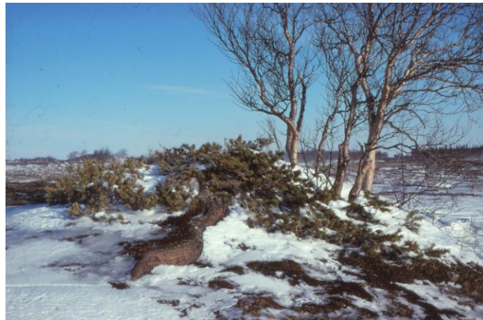
Fig. 12. The winter 1980 was fairly cold and snow poor. Major parts of the canopy was exposed above the snow surface, which was predisposed for winter desiccation of the foliage. Photo: 1980-02-26.