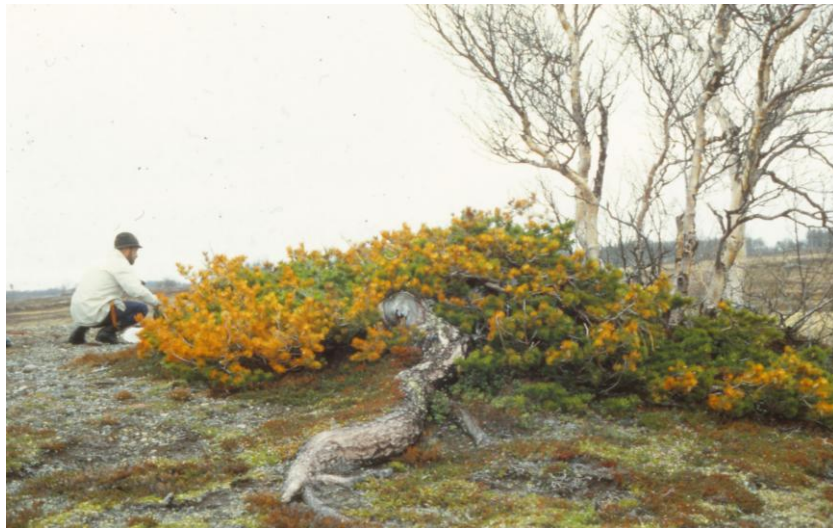
Fig. 14. The injured foliage, highlighted in Fig. 13 still prevailed two years later. Notably, the greenish Empetrum -carpets seen in 1980 (above) have suffered winter-dieback and the Photo : 1982-06-09.