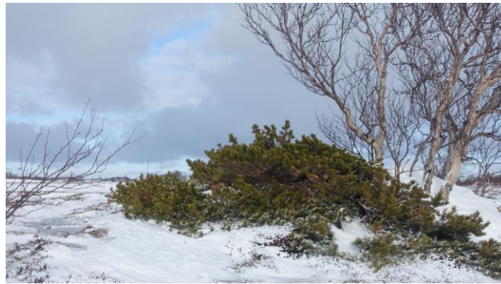
Fig. 17. During the first two decades of the new millennium, winter stress has declined and the maximum height has increased to 1.8 m, soon reaching tree-size. Compared earlier images, the canopy has become fresher and lushier. Photo: 2019-02-20.