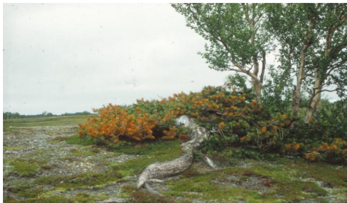
Fig. 13. By the early summer, the injuries from the winter are manifested as browning of the most exposed shoots. Photo: 1980-07-13.