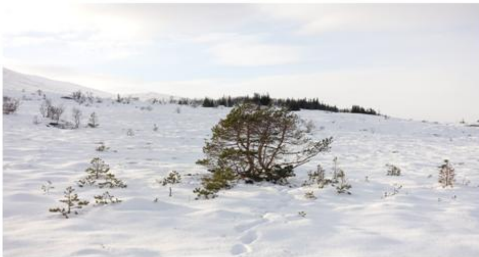
Fig. 21. Up to the present day, the height has increased to 3.5 m and a strong cohort of saplings has emerged during the past 10 years or so. Photo: 2019-11-07.