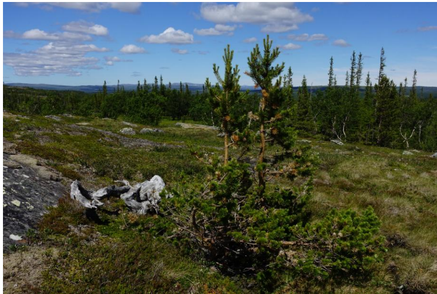
Fig. 2. Old-age krummholz pine in wind-exposed terrain, somewhat below the local treeline. It transformed into tree size by release of vertical stems from wind-stressed modes, concurrent with climate warming in recent time. Observations of this kind highlight the possible role of analogous pine responses to ongoing treeline adjustment to climate warming, i.e. the main focus of this study. Mt. Storsnasen 635 m a.s.l. Photo: 2016-07-29.