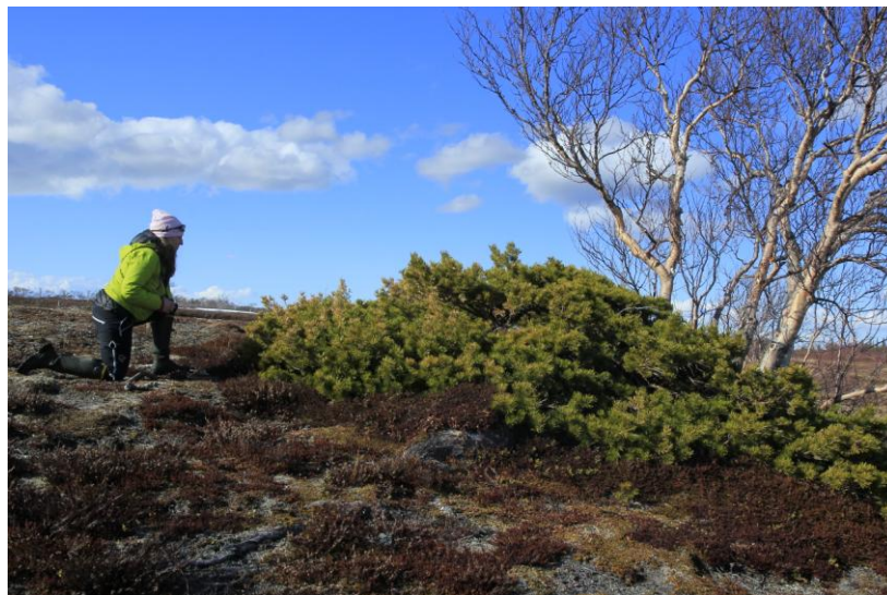
Fig. 15. Following the mid-1990s, winter dieback of the foliage has been insignificant and the appearance of the pine has improved significantly. The maximum height increased to 1.3 m. In addition, the former sparse ground cover of mainly Empetrum hermaphroditum and Kalmia procumbens has massively changed to dense carpets of Calluna vulgaris . Photo : 2013-05-11.