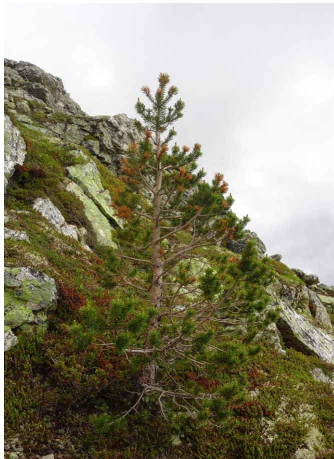
Fig. 1. The predominant mode of current pine treeline advance is upslope spread of seed-generated individuals. This specimen represents advance by 225 altitudinal meters since the early 20th century. Mt. Molnet (Dalarna province), 1100 m ö.h. Photo: 2017-07-03.