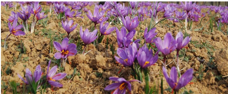
Figure3. Harvesting/Flower plucking time of Saffron in Pampore, Pulwama

Late sowing as well as early sowing of seeds is not recommended in the saffron cultivation. The seeds are generally being sown at the depth of about 8cm to 11cm (4 to 6 inches), however, there is not any strict rule for the planting of seed corms. A distance of about 7cm to 16cm is in between of corms is said to be good for the better yield of crop as when the plant grows it produces a number of baby plants as its outgrowth, so farmer has to leave ample space for these outgrowths of the parent plant. The sowing is done by two methods, either by ploughing method or by zoon method. Plough method is practiced by the large number of farmers as it is easy and less expensive method because labour force needed in sowing gets expensive. The corms are sown in rows, and the field is laid out in square beds by providing the drainage channels outside the beds to drain out the excess amount of water after natural showers (rains) or artificial sprinkler irrigation, so that corms may not get damaged. The bed of Saffron seeds is called as “Poshaware” in Kashmiri. Then after the successful sowing of corms, the field needs time to time water showers, till the time of flowering, as the flowering will do start in the very first year, if properly managed and practiced.