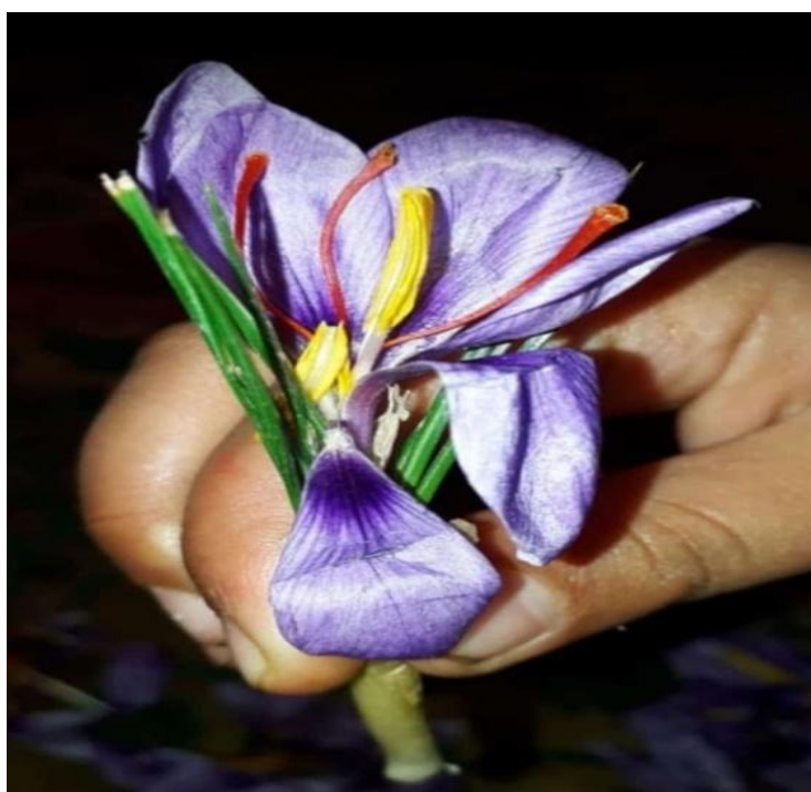
Figure1. Saffron Flower