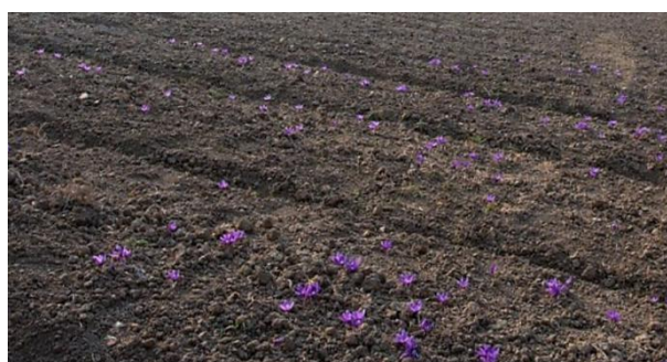
Figure2. Saffron flowering in Fields of Pampore, Pulwama