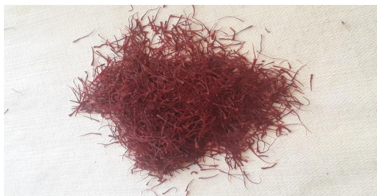
Figure4. Kashmiri Saffron Ready for Use

After the plucking of flowers in very first year of cultivation, the saffron fields are being left untouched upto the advent of new spring (March/April). The fields are again being prepared for yielding of crop. This time only hoeing is done, i.e., operation of providing aeration to the soil, which is considered very useful for the development of corms. Followed by second hoeing in the mid of August, considered to be very much important for good yield of saffron. The last hoeing is done in September, about 30 to 35 days before the flowering of crop and the repairing of saffron beds and drainage channels is also finalized. These operations of hoeing are very much useful for the growth and health of corms and for the good yield of saffron as it provides the aeration to the soil and corms and through which the delicate stems of flowers emerge on the surface.