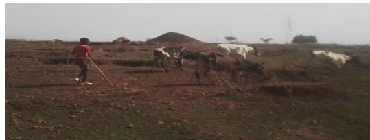
Figure5. stone quarrying impact on movement of animals

As indicated table above more than half 39 (65%) of the respondents were stated that stone quarrying strongly limits free movement of animals to get their feeding from grazing land. Key informants interview of local elders mentioned that areas that are practicing stone quarrying create hole and slopes, wastes from quarry that are not used like sand, stone, and accumulated soil highly influence the free movement of animals.