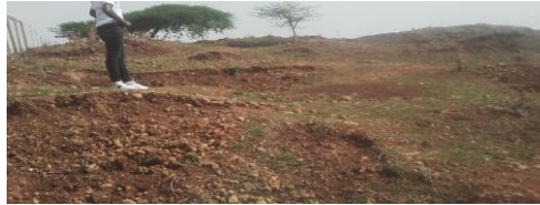
Figure4. The impact of stone quarrying on landscape change

observed some of the occurrences of landslides and soil erosion along quarrying site. The soils and stone are vulnerable to swept down the slope during heavy rains. This was as a result of large holes left after stone quarrying. The land is left bare and huge landmasses were wasted hanging dangerous from high land. The high cliffs which were left are mostly moved and others heaped in the quarry. In support of the present study, Mouflis et al. (2008), finding indicated that quarry activity result in the permanent alteration of original land form and the destruction of original vegetation cover.