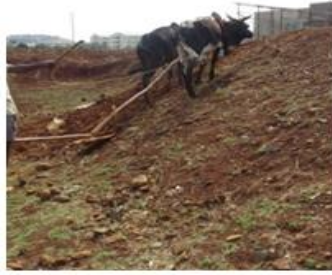
Figure 1. farming obstacle of stone quarrying