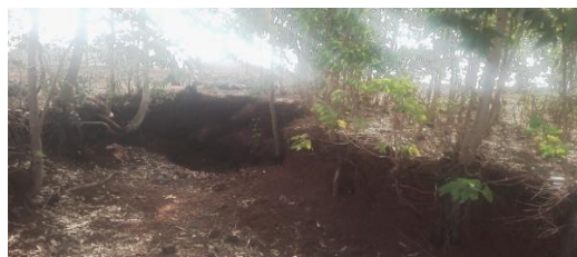
Figure2. stone quarrying impact on loss biodiversity, habitat and deforestation

The above table illustrates that majority 38 (63.3%) of the respondents reported that the stone quarry have great impact on biodiversity, habitat and contributed to deforestation. According to the local elder key informant interview and direct observation in the quarry site with extreme extraction and excavation of quarrying some animals and plants species living in the study site were threatened. Some of the threatened plant species known by their vernacular/local names such as warka, ebis, eshe and animal species known by their vernacular/local names such as dkula, sesa and bezer, because of a place where animals lives and forests are loss and disturbed for the seek of quarry activity.