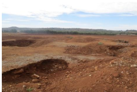
Figure3. the impact of quarrying on land use change from agricultural land use changed to quarrying

According to the table above the majority 37(61.7%) of the respondents reported that stone quarry changed the land use system including previously cultivated land. According to key informant interview the study area land use/ land cover classes categorized in to three groups that includes, settlements, forest and green areas, and agriculture and grass lands. In the past few decade these land use classes changed to stone quarrying.