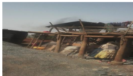
Figure6. impact of quarry on the the air

As we observed in the field survey smoke that released from stone crusher and burded stone the quarry worker used to blust stone easely by addind gasoil(figure 7).