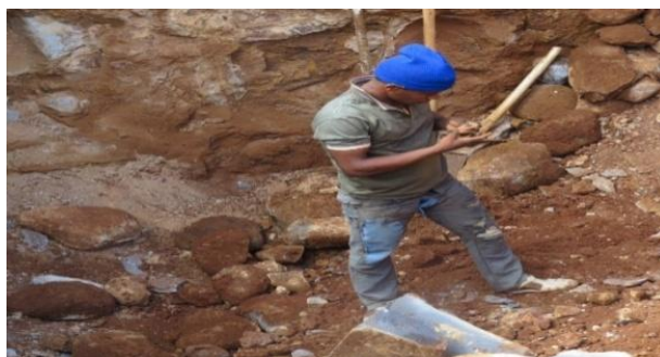
Figure7. physical health damage due to stone quarrying

According to the results, the highest percentage of the respondents 47(78.3%) declared that stone quarry have an impact on physical body health. Key informants of the local elders reported that quarry workers exposed at high risk of physical injury, because materials used to operate the activity can hit the body and the nature of quarry have dusts that can damage an eye. In support to this idea we were observed in the field that from the quarryman hand blood blading was occurred because the stone from the upper part fall to the lower part that he was there.