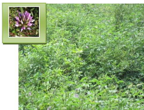
Fig1. Bituminaria bituminosa