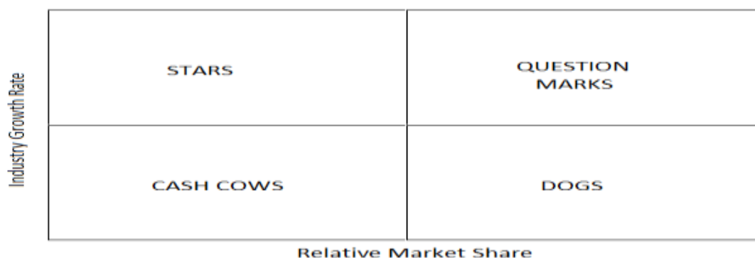
Figure2. Boston Consulting Group (BCG) Matrix Model. Adapted from business policy and strategic management, 2 nd edition, by A.Kazmi, 2006.

carry on this efficiently, the researchers' employed the BCG Matrix model (Kazmi, 2006) shown in Figure 2 above. Although there are other models that deal with positioning for profitable growth, the BCG matrix model will be used for this research. This is based on banks activities that are parallel or uniform to business units in numerous localities, countries, regions, and continents in which banks carry out their activities as separate entities, but all constitute to market portfolio.