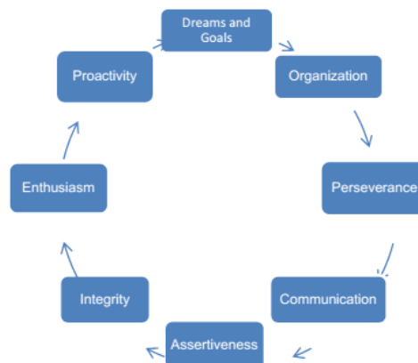
Fig. nº 1 - Personal leadership

However, this requires the development of individual skills (Santos (2004b, p. 144). According to the author, developing human capital means developing individual skills, but that is not enough to have more training, it is essential to change the attitude, responsibility, guiding, encouraging people to meet the objectives previously negotiated. It is also necessary to allocate more autonomy, freedom of action with responsibility for each person to develop their own skills and competencies.