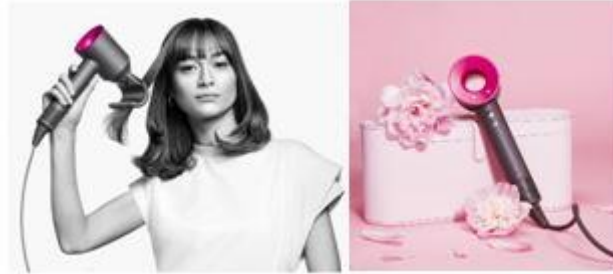
Figure4. Dyson hair dryer

The core concept of Dyson brand is to simplify human life and free users from the instruction-like products. Therefore, its design of many products is based on demand analysis on the pain points that disappoint the consumers in their use, so as to break through the inherent product use habits with technology and innovation and bring people eye-catching and extremely useful products. This is the core reason why Dyson hair dryer has become a product that "makes you scream".