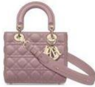
Figure2. The Christian Dior Lady Dior Handbag

Source: Official website of Christian Dior