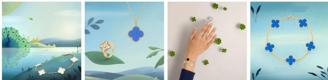
Figure3. Van Cleef & Arpels

Since the establishment of the Van Cleef & Arpels brand, the couple always adhered to the original design concepts and unique styles, and the brand has always been a luxury jewelry brand loved by celebrities and dignitaries in the world. At first, Van Cleef & Arpels made customized jewelry for the royal families and nobles. A jewelry brand usually has a classic design element that conforms to brand characteristics. The main popular elements of luxury jewelry in the world include Cartier's "screw" shape, Bvlgari's "spring" shape, and Tiffany's "key". The most famous design of Van Cleef & Arpels is the four-leaf clover-inspired Alhambra design. The Alhambra collection products use high-quality materials selected according to strict quality standards. They are first carved with gems, then polished, and finally made into round beads, which are then processed with handcraft. Each work goes through 15 continuous processes with exquisite workmanship.