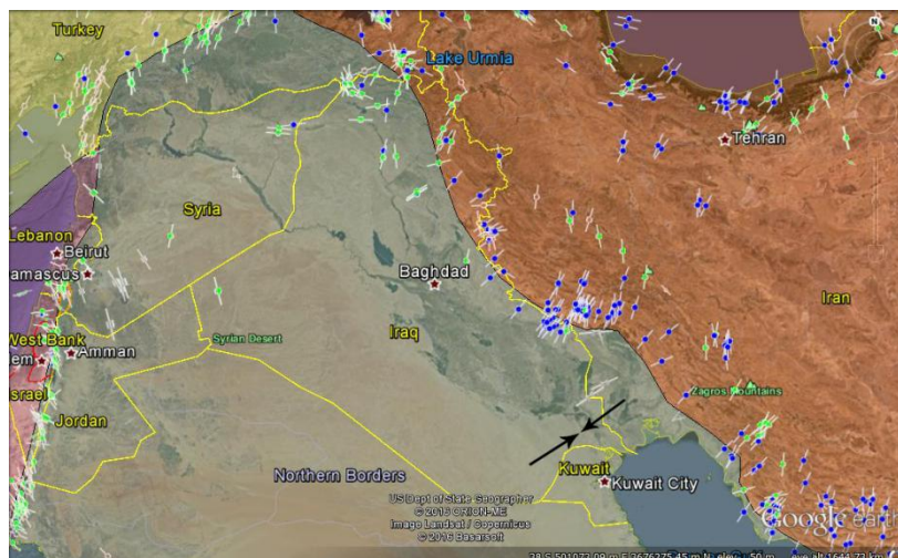
Figure4. The maximum horizontal stress directions (NE-SW) of Zubair oilfield with respect to the regional stress directions (modified from WSM, 2016).

The predicted orientation of S_{Hmin} extracted from breakouts which is NW-SE gave an indication that the direction of S_{Hmax} is NE-SW in Zubair oilfield (about 40^{\circ} to 60^{\circ} from the North). This stress trend had an analogous agreement with the regional maximum horizontal stress direction as demonstrated in figure (4). The present-day regional stress direction is driven from variable kinds of physical data, for example well bore breakouts, earthquake focal mechanisms and fault-slip analysis (Carafa et al. , 2015)