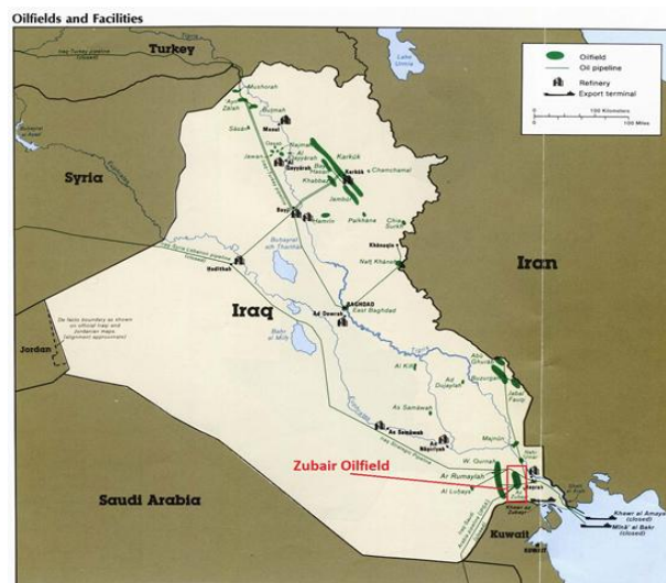
Figure1. Study area

Zubair is a supergiant oilfield discovered in 1949, it is located 20Km to the west of Basrah city in southern Iraq, and encompasses an area of 900 \text{ Km}^2 . It forms an 60Km north-south anticline, The field is close to the border of Kuwait in the northeastern part of the Arabian Peninsula as presented in figure (1); it is made up of four domes (Safwan, Rafidiyah, Shuaiba and Hammar).