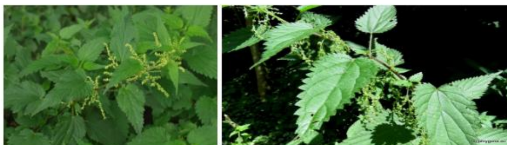
Figure 1 : Photograph of Urtica dioica L. plants

Urtica dioica was collected in May 2018 from D Errihan locality in Seliana governorate (154 km from capital of Tunis; 36.31°9027' N and 962°4003' E; superior semi-arid bioclimatic stage; mean annual rainfall: 500-600 mm). The harvested plants were identified at the Biotechnology center of the Technopark of Borj-Cedria by Pr Abderrazek SMAOUI ( Figure 1 ).