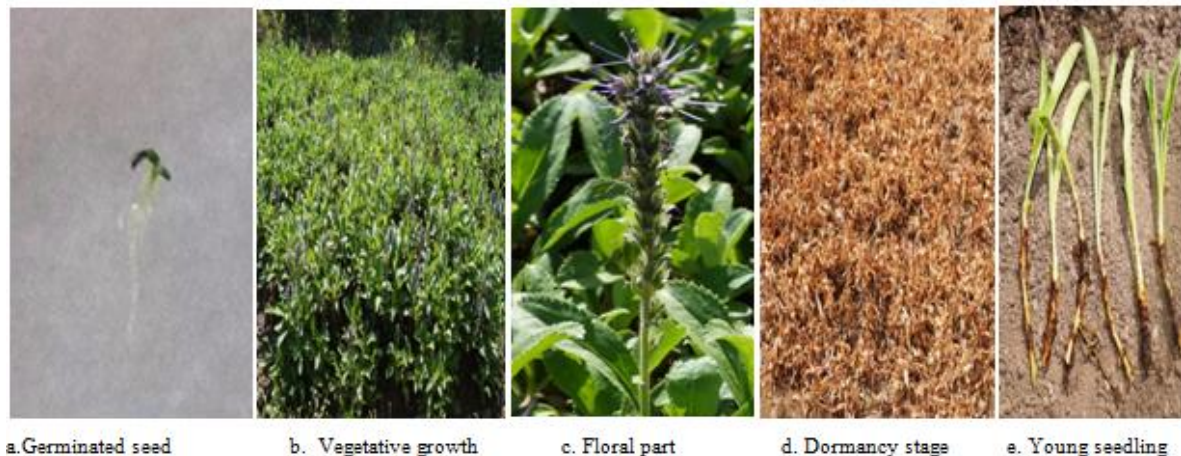
Fig1. Picrorhiza kurroa : Different phenophage

Every step should be taken to conserve the medicinal or other plant diversity of the regions which is already in a critical level that can be justified by observing the present percentage of forest, inclusion of species in red data book or changed phenological behavior of the plant species.