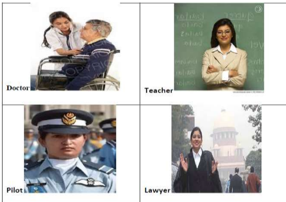
Figure4. Adapted from Kumari (2014)

Each learner has her own dreams and ambitions of life. This can be used as a good breeding point for interaction. The activity is open ended which leads to a lot of speaking. Students would be asked to look at these pictures and answer the questions: