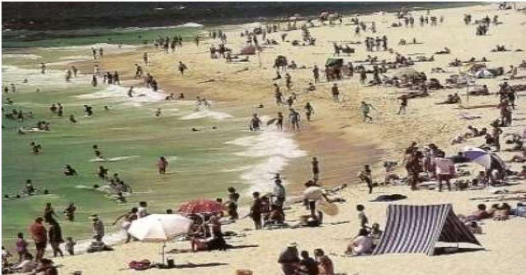
Figure3. Adapted from Kumari (2014)