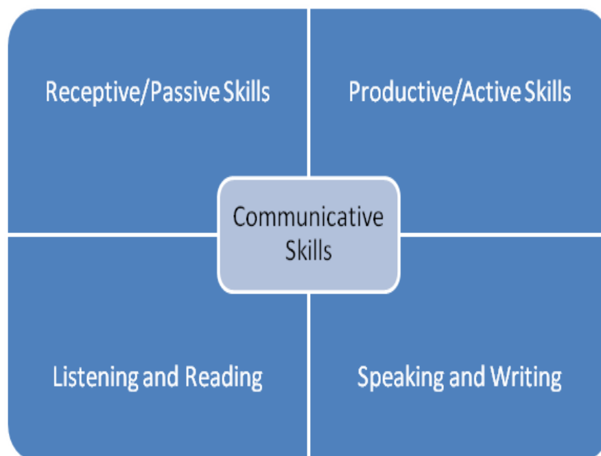
Figure2. Adapted from Rao & Jyotsna (2009)