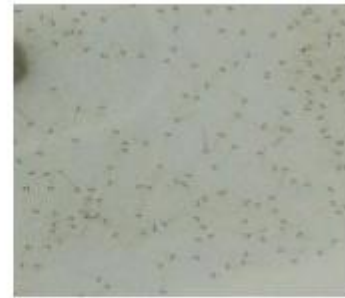
Fig3. Newly hatched fry