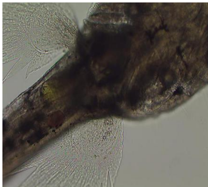
Fig7. The red dot is the liver

Larval stage II refers to the mixed nutrition period in which the yolk sac is about to disappear, the mouth of the fry has been opened and there is simultaneous existence of both endogenous and exogenous nutrition stages, and the time is 8-12 hours. The larvae begin to ingest food, and organs such as intestine and liver gradually differentiate, but they are not perfect. At this time, the total length of the larvae is 4.78-5.18mm, and there are soft fin branches in the pectoral fin. From the third day of hatching, the end of the soft fin rays begins to expand, and the maximum number of branches is 16-18 sticks. The sensory hairs on the head are shorter than those at the beginning of the hatching, and the length is 0.11-0.13mm. However, the sensory hairs on both sides of the body are longer than those at the beginning of the hatching, and the length is 0.071-0.095mm. On the 7th day after hatching, above the foregut, a red oval liver appears (Fig. 7). During this period, the fry moves in the bottom of the water, especially likes to move in the water plants.