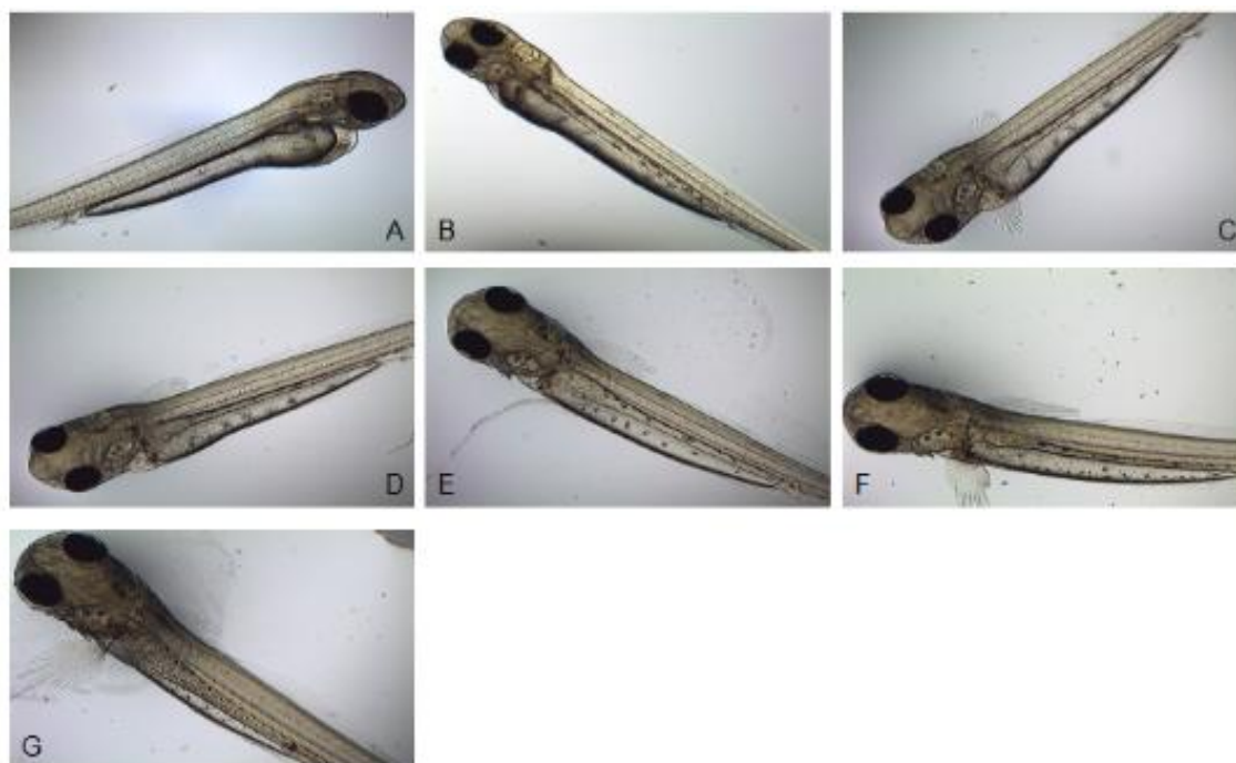
Fig6. The changing process of yolk sac

Note: A. hatching for 0 h; B. hatching for 6 h; C. hatching for 12 h; D. hatching for 18 h; E. hatching for 24 h; F. hatching for 30 h; G. hatching for 36 h