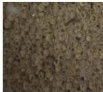
Fig2. Egg membrane after fry hatching