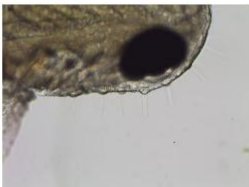
Fig4. Sensory mound and sensory hair of the head

The larval stage I of Abbottina rivularis refers to the endogenous nutrition period from hatching of fry to the disappearance of yolk sac. The total length of the newly hatched larval is 3.32-4.67mm. The color of the body is transparent. The heartbeat and blood flow are clearly visible. On the head, dense sensory mounds and sensory hairs are distributed from the snout to the gill cover on both sides, from the upper jaw to the top of the head and from the lower jaw to the pectoral fin (Fig. 4), and the length is 0.048-0.168mm. There are sensory mounds in each sarcomere on both sides of the body, and on most of the sensory mounds, there are sensory hairs, while on a few of sensory mounds, there is no sensory hair (Fig. 5). From the pectoral fin to the base of the caudal fin, the sensory mounds are arranged in two rows along the spine, and the length is 0.041-0.068 mm (Table 1). The notochord and sarcomere are clear; the pectoral fin has soft fin and there are branches, and the maximum length is 0.768-0.948 mm, and there is no differentiation occurring on the dorsal fin, caudal fin and anal fin. The yolk sac is larger, the long diameter is 0.62-1.21mm, and the short diameter is 0.26-0.41mm. The yolk sac of Abbottina rivularis disappears after 24-27 h (Table 2) (Fig. 6), and during this period, the fry moves in the bottom of the water.