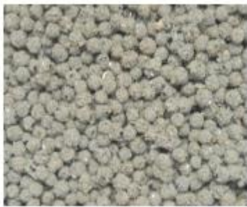
Fig1. Fertilized eggs

The yolk sac absorption time of the hatched larvae (Fig. 3) is very short, so the time of endogenous nutrition stage is also relatively short; the characteristics if transformation from endogenous nutrition stage to exogenous nutrition stage are not obvious; after the exogenous nutrition stage comes, the food they feed on is not specific. At the same time, the occurrence of its swim bladder is lagging behind, and there is no obvious characteristic of its development as that of conventional fish for us to refer to. For the convenience of description, we divide the postembryonic development into three stages: larval stage I, larval stage II and larval stage III.