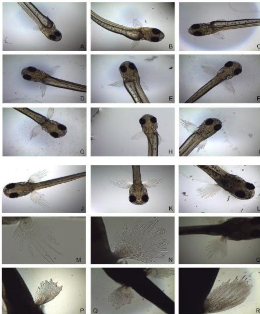
Fig8. Morphological changes of pectoral fin

A: 0 h after hatching, B : 6.5 h after hatching, C: 13 h after hatching, D: 19.5 h after hatching, E: 26 h after hatching, F: 32.5 h after hatching, G: 39 h after hatching, H: 45.5 h after hatching, I: 52 h after hatching, J: 58.5 h after hatching, K: 65 h after hatching, L : 72 h after hatching, M : 15 d after hatching, N : 19 d after hatching, O : 23 d after hatching, P : 27 d after hatching, Q : 30 d after hatching, R : 33 d after hatching