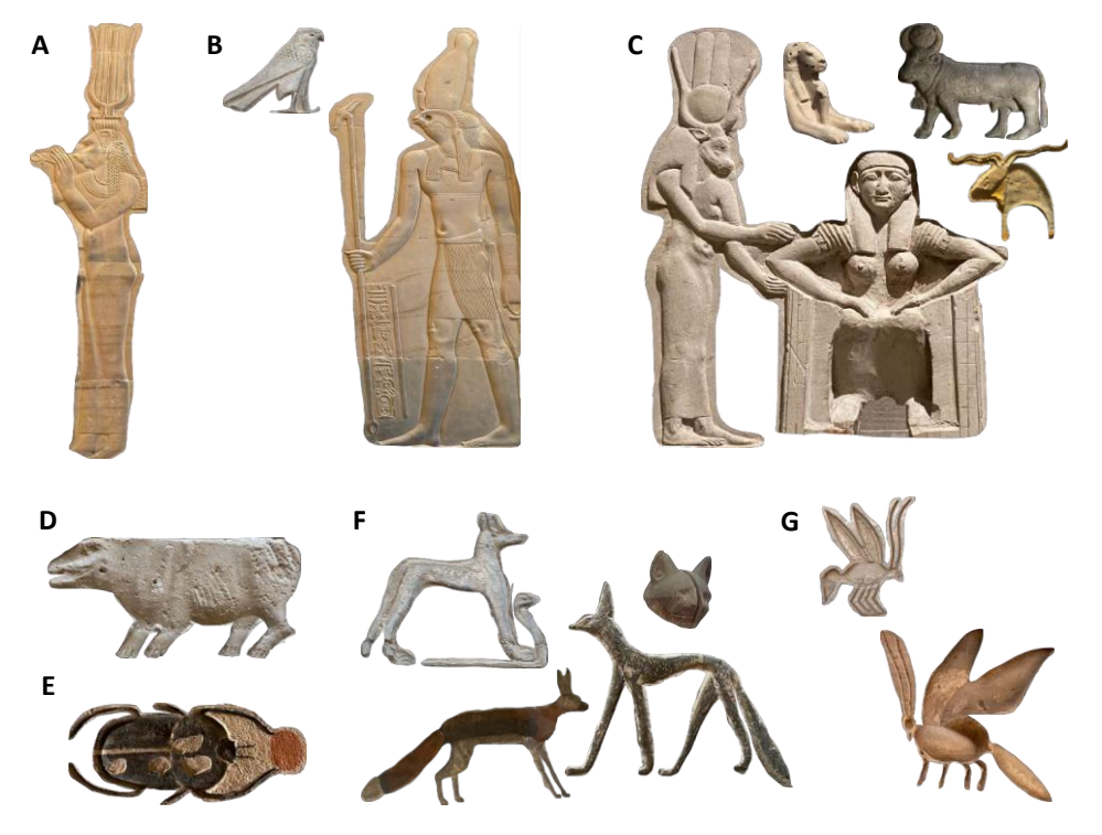
Figure1. Animal representations in ancient Egypt culture with connection with human health. (A)Lion: Sekhmet, the goddess of healing and medicine. (B)Falcon: Horus, the god of protection.(C)Cow: Goddesses of birth, fertility, and nourishment.(D)Hippopotamus: Opet and Taweret, goddess of protection and nourishing.(E)Scarab S. sacer: symbol of the sun god Ra with protective capacity. (F)Dogs and cats: prominent roles in Egyptian mythology and human protection.(G)Bees: association with prevention of infectious diseases.Images and design by the author.

Bees: association with prevention of infectious diseases. Bees were associated with Egyptian royalty and pharaoh titles [Fig. 1G]. Beekeeping was practiced in ancient Egypt with moving hives all over the Nile to pollinate flowers in season. Honey was used for preventing infection by being placed on wounds.