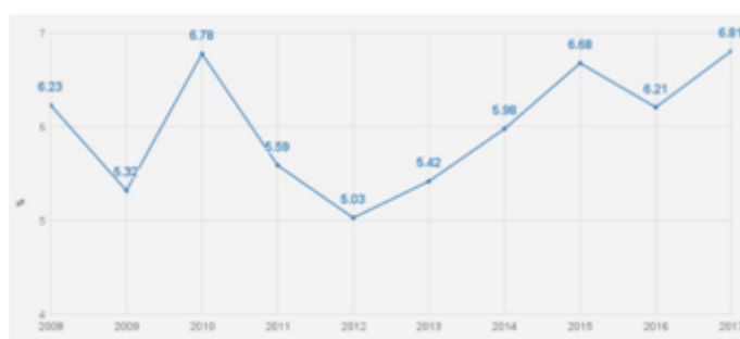
Fig2: Vietnam's economic growth rate from 2008 -2017 7

In fact, Vietnam, despite difficulties, in 2017 economic growth reached 6.81%, exceeding the target 6.7%, the highest in 10 years