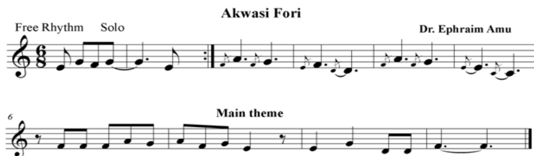
Example1. Excerpt from Akwasi Fori

In the traditional contextual settings atenteben is prevalent at funeral ceremonies which are common among the Akan speaking communities borrowed by the Ewe and Ga ethnic groups. Accompanying the reading of tributes to a deceased person with atenteben music in the background is widespread in Ghana. The most popular dirge for this purpose is Akwasi Fori composed by Amu.