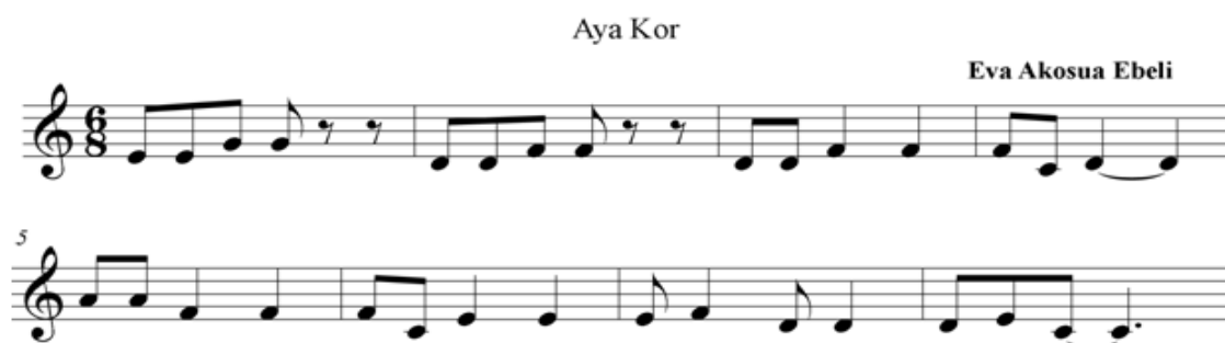
Example2. Excerpt from Aya Kor

The incorporation of atenteben music into the reading of tributes of a deceased at a funeral has stimulated the composition of new tunes as dirges by several music scholars to enhance Amu's legacy. Notable among them are Obaakofo Ankonam by Aduonum, Dagadu by Mereku and Ayakor by Ebeli (2013).