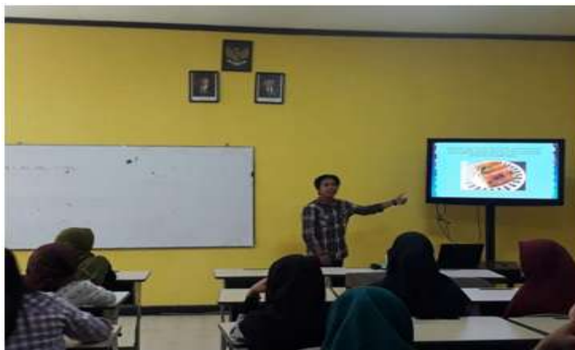
Figure2. Orientation Prol Papaya Product

materials, a manufacture of prol papaya products which are, then, packaged into packing boxes. The development of research instruments is to determine the level of students’ multi-business awareness and ability conducted by product socializing through exposing prol papaya products as the result of the awareness of multi-business capability. The instrument was distributed at the forum. The existing data was analyzed and it generated information about the awareness of students’ multi-business ability.