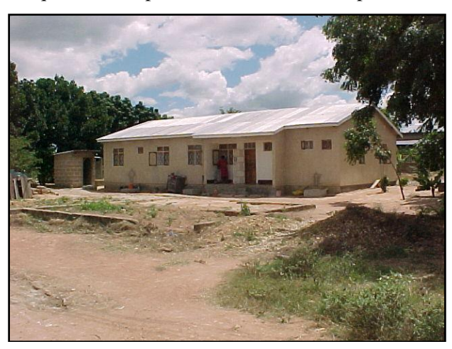
Fig1. A house constructed through cooperative efforts in Dodoma, Tanzania.

that was provided either free or at subsidized price contributed towards reducing construction costs. The forth aspect is financing. Housing Cooperatives that were established in 1970s and 1980s managed to access financial loans from the then Tanzania Housing Bank (THB) for their members. This component was crucial in house construction apart from the fact that in some instances, the amount of loans was not adequate for cooperative members to complete their house construction.