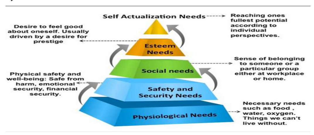
Figure 2. Maslow's Hierarchy of Needs model

is turned to satisfying this higher need. This theory formed an important base for this study because it identified safety needs as being important to the well-being of people at Sefula Secondary School. After meeting the physiological needs, the stakeholders in the school required assurance that their safety and security needs would be addressed. It was therefore, imperative that Sefula Secondary School management fostered safe and secure environments to facilitate increased learners enrolment, retention, completion and hence attainment of quality education. In short, the adage 'safety first' is appropriately applicable to this school situation. Figure 2 below shows a summary of Maslow's Hierarchy of Needs model.