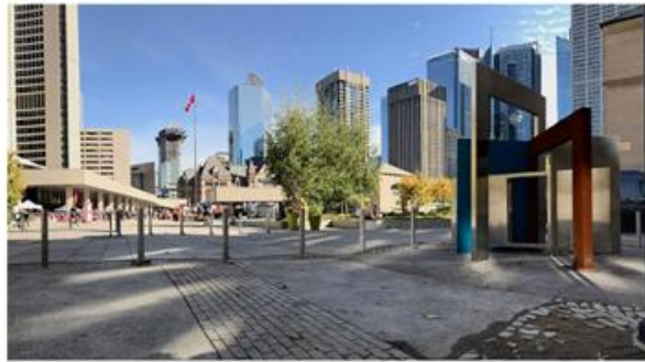
Access to Justice: 2017 Stainless steel: Corten Steel: Epoxy painted steel 3.6 x 2.7 x 3.5M

Fabricated at Lafontaine Iron Werks Ontario for McMurtry Gardens of Justice Toronto. John Atkin