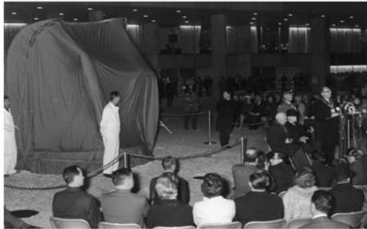
The unveiling of the sculpture on October 27, 1966, image courtesy of the City of Toronto Archives.

collaboration eventuated in Moore's "Three Way Piece" (referred to as "The Archer") taking centre stage within the new Modernist civic square. The Archer heralded a significant change of attitude amongst the Canadian population during the 1960's Cultural Revolution in Toronto and laid down a design tenet for civic spaces to be coupled with public art, that has provided a lasting legacy to this present day.