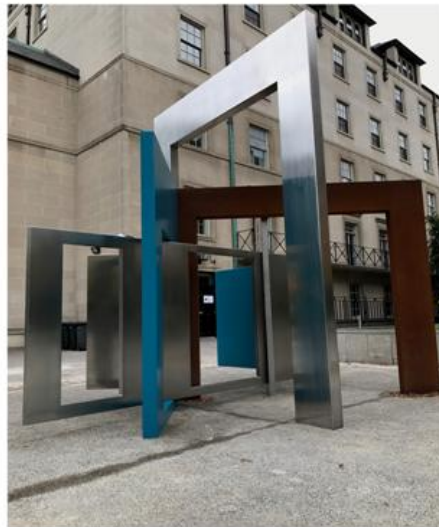
Access to Justice: 2017 Stainless steel: Corten Steel: Epoxy painted steel: 3.6 x 2.7 x 3.5M

As referred to earlier, my use of colour in this sculpture is important as it stimulates cognitive connectivity to the great expanses of water of Canada's Great Lakes, which creates a topographical three-dimensional contrast between land and water. Stainless steel is a light-reflecting neutral material: its surfaces capture the reflections of all nationalities into the forms of the artwork: thus suggesting equality before the Law and empowering all nationalities access to the Law.