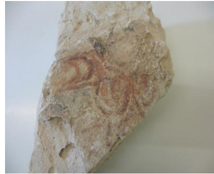
Figure 8. Remains of muqarnas – dancer- found in the excavations of the Convent of Santa Clara, Murcia dated to the Mardanišī period (543/1148-567/1172). (SC853AVIII19, 277 x 119 mm. Archive of the Museum of Santa Clara, Murcia)