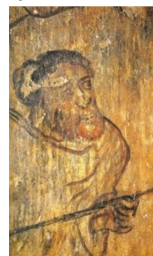
Figure6. Portrait of the caliph or prince leading the hunt in the left-hand nave of the great hall of Qusayr ‘Amra. Almagro Basch, et al. (2002) Qusayr ‘Amra. Residencia y baños omeyas en el desierto de Jordania. Granada: El Legado andalusí . 83.