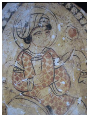
Figure 16. A muqarnas fragment from the Hammām of Abū'l-Su'ud in Fustāṭ . André Raymond et al. (2000). Le Caire. Paris: Citadelles & Mazenod . 132.

fourth/tenth centuries. 56 This chronology is not totally convincing. Instead, they may most probably be dated to the fifth/eleventh century onwards, 57 which coincides with the extraordinary development undergone by muqarnas decoration in the Eastern Islamic lands. In these fragments, specifically in the one representing the seated man (Figure 16), the same features are seen as in the examples studied in this paper. So, for example and although there is no surviving similar figure in Murcia, the figure of a man and his seated posture with a glass in his right hand can be compared with several samples preserved in the ceiling of the Cappella Palatina in Palermo (Figure 12). And in fact in Fatimid Egypt there are further examples that show that link with Abbasid painting, such as can be seen in ceramic pieces dating from the same sixth/twelfth century 58 . In the same line, Hunt has shown that the paintings in the Cappella Palatina can also be compared to Egyptian Christian paintings, 59 which enables us to confirm the direct influence of Egypt on Norman Sicily.