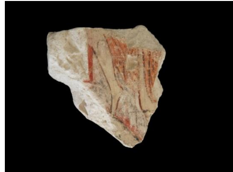
Figure4. Remains of muqarnas – feet- found in the excavations of the Convent of Santa Clara, Murcia dated to the Mardanisī period (543/1148-567/1172). (MSCL/CE 070181, 175 x 188 mm. Archive of the Museum of Santa Clara, Murcia)

This piece is displayed in the Santa Clara Museum separately from the fragment showing the bearded man; however, in my opinion they form part of the same scene, as shown in the photomontage in Figure 5. In this sense, despite the fragmented state of both pieces it is possible to continue the drawing and to suggest that it must have been the figure of a possible bearded “sovereign”, seated (as seen from the position of his feet) and carrying a flowering rod or else a staff for directing a hunt. This is in line with representations of the same type such as that surviving in the left-hand nave of the great hall of Qusayr ‘Amra from the second/eighth century (Figure 6). 37 Another possibility is that it may be a musician, also seated, playing some sort of instrument with a long neck.