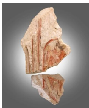
Figure5. Photographic montage: remains of muqarnas found in the excavations of the Convent of Santa Clara, Murcia dated to the Mardanisī period (543/1148-567/1172).

This piece is displayed in the Santa Clara Museum separately from the fragment showing the bearded man; however, in my opinion they form part of the same scene, as shown in the photomontage in Figure 5. In this sense, despite the fragmented state of both pieces it is possible to continue the drawing and to suggest that it must have been the figure of a possible bearded “sovereign”, seated (as seen from the position of his feet) and carrying a flowering rod or else a staff for directing a hunt. This is in line with representations of the same type such as that surviving in the left-hand nave of the great hall of Qusayr ‘Amra from the second/eighth century (Figure 6). 37 Another possibility is that it may be a musician, also seated, playing some sort of instrument with a long neck.