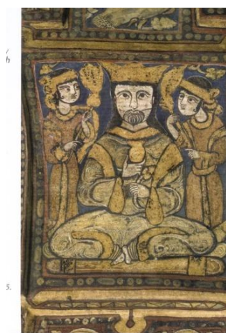
Figure 12. Seated monarch: detail from the ceiling of the central nave of the Cappella Palatina in Palermo (1132 y 1143). La Cappella Palatina a Palermo/The Palatine Chapel in Palermo. Mirabilia Italiae Guide (2013) edited by Alessandro Vicenzi. Trento: Franco Cosimo Panini. 51.

In Monneret de Villard’s opinion there is no specific plan to the iconography, but the paintings are scattered arbitrarily according to the taste of the artist. Meanwhile, on the issue of authorship, Monneret suggests the possibility that there were several groups of artists, animal painters who had more in common with textile artists, and painters of human figures. 43