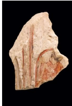
Figure3. Remains of muqarnas – bearded man- found in the excavations of the Convent of Santa Clara, Murcia dated to the Mardanisī period (543/1148-567/1172). (MSCL/CE 070128, 375 x 315 mm. Archive of the Museum of Santa Clara, Murcia)

However, the most interesting depiction is figurative. Particularly remarkable is the presence of a figure, apparently a woman because of the representation of rouge on her cheeks, which appears with a wind music instrument, the mizmar (Figure 2). This piece is on display in the Museum of Santa Clara in Murcia together with other very interesting remains of muqarnas , like the fragment that shows a seated bearded man (Figure 3), whose posture is hard to determine owing to the fragmentation of the piece and its deteriorated state. In the opinion of Navarro Palazón, it is possible that the figure is carrying on his shoulder a staff, or more likely the stem of a plant representing abundance in the form of a leaf or palmette. 35 In either case they are attributes of power symbolizing the dignity of the Prince and the opulence and fertility that exist under his rule, though the figure carrying it should not be identified with the sovereign. 36 A third image, also incomplete, represents the lower part of some legs, with bare feet and part of a reddish coloured tunic (Figure 4).