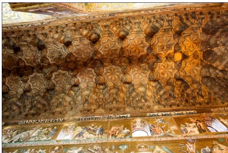
Figure11. View of the ceiling of the central nave of the Cappella Palatina in Palermo (1132 y 1143)

Much research has been done on the building in general and on this pictorial decoration in particular: that of Ugo Monneret de Villard, entitled precisely Le pitture musulmane al soffitto della Cappella Palatina in Palermo and published in 1950, is the first comprehensive investigation of the paintings