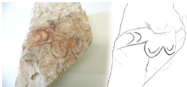
Figure15. Remains of muqarnas found in the excavations of the Convent of Santa Clara, Murcia dated to the Mardanišī period (543/1148-567/1172) and author's drawing. (SC853AVIII19, 277 x 119 mm. Archive of the Museum of Santa Clara, Murcia)