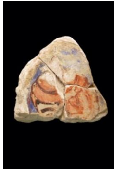
Figure 7. Remains of muqarnas – turban- found in the excavations of the Convent of Santa Clara, Murcia dated to the Mardanišī period (543/1148-567/1172). (MSCL/CE 070127, 197 x 195 mm. Archive of the Museum of Santa Clara, Murcia)

Another fragment, also incomplete, depicts the top of a turbaned head represented with broad strokes of orange-red, and shows part of the right eyebrow, whose rounded shape is reminiscent of the style of Abbasid art (Figure 7). Other examples display body parts, such as a bust of what looks like a dancer, of which more later (Figure 8), and the head of a small bird, probably an eagle by the characteristics of its head and beak (Figure 9).