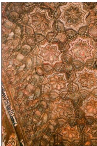
Figure10. View of the ceiling of the central nave of the Cappella Palatina in Palermo (1132-1143)

1132 and 1143. The Cappella Palatina, is undoubtedly at the same time one of the most representative and enigmatic buildings, due to the use of artistic elements of Islamic origin in a religious building, such as in the ceiling of the nave. 38 It was clearly used as a place for royal receptions, designed to show majesty, power and divine authority. 39 The interior space is organized into three aisles decorated with an extraordinary iconographic series, in which remarkable use is made of paintings and mosaics reproducing various motifs and religious scenes. However, what is most interesting for the purposes of this paper is the ceiling covering the nave, which uses muqarnas decoration to cover the entire surface, as well as star-shaped polygons which contribute to the creation of a celestial sphere, in accordance with the magnificence of the Norman king (Figure 10 and Figure 11). These stars are decorated with arabesques and inscriptions reading happiness, strength, peace and perfection , among other expressions. 40 The muqarnas cells have a pictorial decoration showing plant and geometric motifs and fascinating figurative animal and anthropomorphic images.