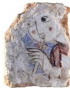
Figure2. Remains of muqarnas –flautist– found in the excavations of the Convent of Santa Clara, Murcia dated to the Mardānīsh period (543/1148-567/1172). (MSCL/CE 070179, 120 x 90 mm. Archive of the Museum of Santa Clara, Murcia)