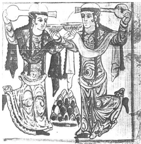
Figure13. Dancers. Mural painting from the Jawsaq al-Khaqānī palace in Samarra (third/ninth century) according to Hertzfeld’s reconstruction of the original. Grube (1980). La pittura dell’Islam: miniature persiana dal XII al XVI sec. Bologna: Capitol. 10.

In spite of the poor state of preservation of the Murcia fragments showing figure decoration, it is possible to draw very interesting parallels with the examples located in the Capella Palatina. A very interesting example is that of the female dancers or dancing figures, whose origin is again found in Abbasid painting of Samarra and in the Sasanian painting. 47 Thus in the place occupied by the harem in the Jawsaq al-Khaqānī palace part of a fresco has been preserved and reconstructed by Hertzfeld. It represents two dancing girls carrying a sort of shawl in their arms (Figure 13) 48 .