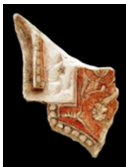
Figure1. Remains of muqarnas found in the excavations of the Convent of Santa Clara, Murcia dated to the Mardānīsh period (543/1148-567/1172) (MSCL/CE 070126, 304 x 213 mm. Archive of the Museum of Santa Clara, Murcia)

The examples of muqarnas found in Murcia formed part of the so-called Dār al-Ṣuġhrā (now known as the Old Palace of Santa Clara to distinguish it from the Qaṣr al-Ṣagīr or New Palace of Santa Clara). 31 The attribution to Ibn Mardānīsh of this palace, built in about 539/1145, 32 and not in the preceding Almoravid period, is based on the analysis of the arabesques that decorate the plasterwork, with a style and technique different from that used previously in Andalusī art. 33 The cells of muqarnas are made of brick, covered afterwards with stucco and then with paintings, which must have formed part of the decoration of a cupola of this palace. The painted images depict natural, geometric and figurative motifs. The examples showing plant decoration generally show the motifs on a red painted background, and are usually single and double palmettes as well as flowers and fruits. As Navarro Palazón has shown in his numerous publications on the subject, this painted plasterwork is closely related in style to the carved plaster belonging to the same palace. 34 The geometric decoration generally consists of friezes made of strings of small beads decorating the edges of the muqarnas cells (Figure 1).