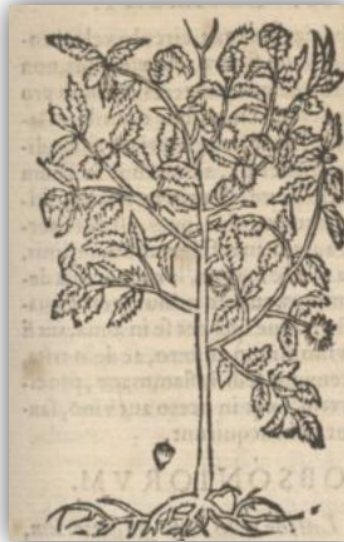
Figure1. Chestnut illustration in the work Index Dioscoridis [3][4].

The portuguese doctor also included in his work comments for each one cure that are appropriate to the evolution of concepts related to the new medicine, from China and the New World, assuming a revolutionary attitude in the XVI century [7].