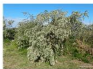
Grown up tree