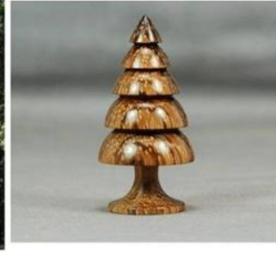
Craft from tree lucerne wood