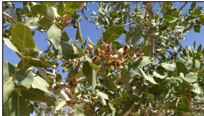
Figure6. Pistachio tree in Gaz town's garden

Pistachio tree is highly resistant against drought and dryness, so that the old trees can be survived without irrigation for a long period (even for several decades). The abandoned pistachio gardens, which are subject of this work, are situated at the east of the famous caravansary of Gaz, and are evidence for this claim.