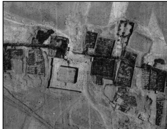
Figure3. Situation of Gaz caravansary and surrounding pistachio gardens (about 50 years ago)

There was an old aqueduct in Abbasi Caravansary of Gaz town. Figure 3 indicates aerial image of the old area under study, and Figure 4 shows its status currently. This aqueduct has been abandoned for years. The gardens discussed in this study are located in vicinity of the aqueduct, which are currently not in use and have become a site for garbage accumulation (Fig. 5).