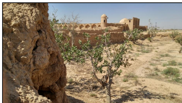
Figure5. Pistachio garden in three-meter depth and Gaz caravansary in its background