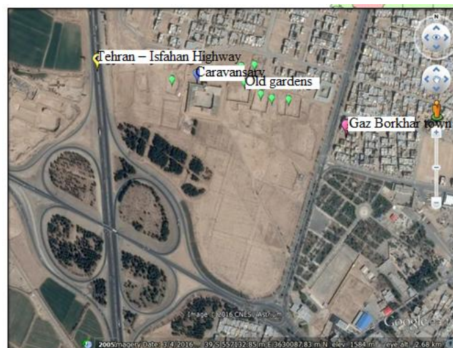
Figure2. Situation of caravansary and old pistachio gardens in vicinity to Gaz town and Isfahan - Tehran Highway

Gaz has semi-arid climate in terms of climate and it is considered as mild semi-desert climate climatologically. Its rainfall is lower than Isfahan and its evaporation is higher than Isfahan. The soils of the region are generally clay with relatively high adhesion with a little amount of sand. Although now Gaz is famous for car exhibitions and brick production, it dates back to the advent of Islam. Although now Gaz is famous for car exhibitions and brick production, it dates back to the advent of Islam. Hamdullah Mostofi in “Nazhat-ol-Gholub” wrote: “Bahman Ibn Isfandiyar built a fire temple in village Jaz (Arabic pronunciation of Gaz). Seemingly this fire temple was turned into the mosque following invasion of Arabs to Iran and influence of the Islam.”