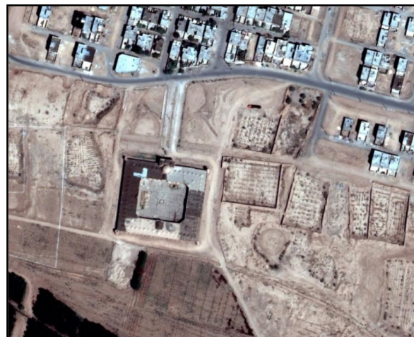
Figure4. Current status of Gaz caravansary and surrounding pistachio gardens