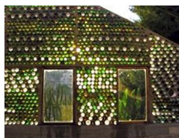
Recycled Glass Wall