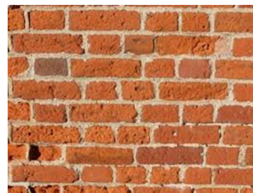
Clay Brick Wall