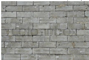
Fly Ash Brick Wall