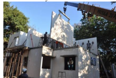
Glass Fiber Reinforced Gypsum (GFRG) Panel