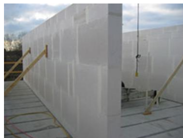
Autoclaved Aerated Concrete (AAC) Block