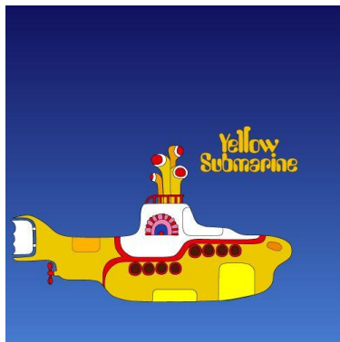
Figure1. Yellow Submarine [4]

To the Beatles and their song: “Yellow Submarine”