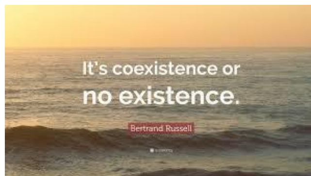
Figure3. About coexistence [7]