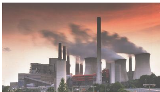
Figure2. Thermal Power Station

In XX-XXI centuries flaring of gas, liquid, pulverized fuel in furnaces, fire boxes, combustion chambers was widespread. For example, a steam boiler box of 300 MW unit is a rectangular parallelepiped of 14 m width x7m depth x35 m height. When working on fuel oil, the furnace burns 67 tons of fuel every hour (Figure 2). High temperature radiating gas volume is formed in the furnace and fills it. All of 10^{30} - 10^{45} atoms radiate in the torch. The radiation of each atom to the calculated area is to be considered.