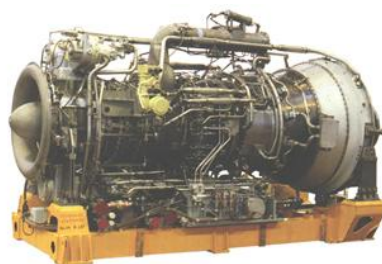
Figure5. Gas turbine plant

On the basis of the disclosed laws of heat radiation from cylindrical gas volumes, a new concept of calculating heat transfer in electric arc and torch furnaces, fire boxes, combustion chambers of gas turbine plants developed (Figure 5). According to the new concept, dozens of calculations of heat transfer in electric arc and torch furnaces, fire boxes, combustion chambers were performed, which results are presented in [5-17]. Experimental studies have confirmed that the error of such calculations does not exceed 10%. This new concept of calculation of heat transfer in electric arc and torch furnaces, fire boxes, combustion chambers is confirmed by experimental studies and approved by the Educational and Methodical Association for education in the field of metallurgy of the Ministry of education of the Russian Federation as a textbook and is used for training students and postgraduates. Laws of heat radiation from gas volumes (2) – (6) combined with the laws of heat radiation from blackbody (1) entered into the textbook [5].