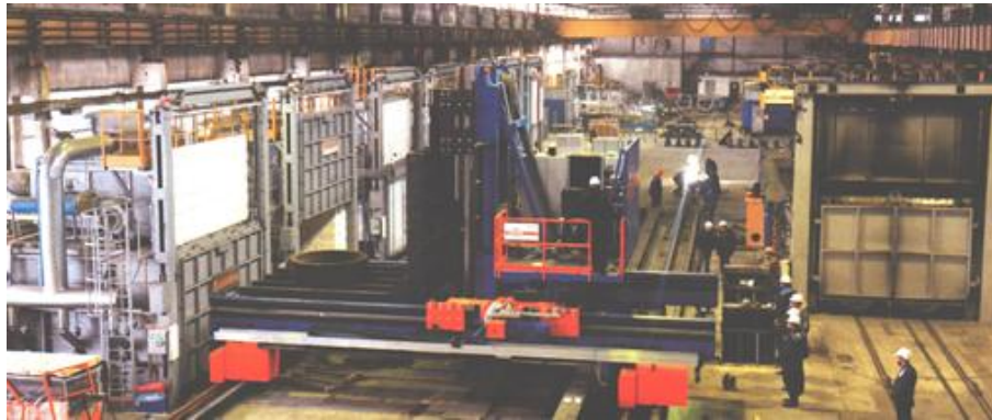
Figure3. Heating furnace

The calculations of heat transfer by radiation in torch furnaces (Figure 3), fire boxes, combustion chambers were carried out by zonal and numerical methods in the twentieth century. In zonal and numerical methods, the furnace is divided into 1–1,5 million cells, the radiation from gas volume of the torch is modeled by the radiation from the surfaces of these cells. In case of surface and volume zones, we use numerical discrete approximations of radiation heat transfer integral equations for calculating radiation fluxes and zone temperatures on the computer. These methods use the large number of approximate temperatures and optical coefficients of zones and the law of heat radiation from blackbody, the Stefan-Boltzmann law (1). However, the radiation from gas volumes of torches is not subject to the Stefan-Boltzmann radiation law and the calculation of combustion products error accounts for 70-90% or more [5-8].