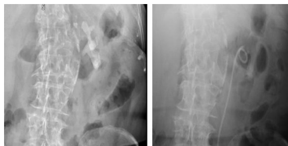
Figure3. Pre- and post-op KUB xray

Since her procedure and subsequent stent removal 4 weeks later, she has had no post operative complication and has been free of UTI or any symptoms. Her 3 months follow up CTKUB in Figure 4 did not show any residual stones or dust.