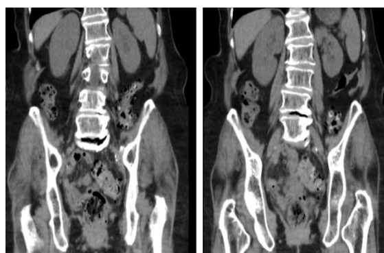
Figure4. Three months postop CTKUB images showing dust-free status

Since her procedure and subsequent stent removal 4 weeks later, she has had no post operative complication and has been free of UTI or any symptoms. Her 3 months follow up CTKUB in Figure 4 did not show any residual stones or dust.