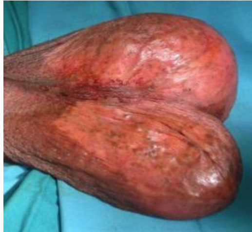
Figure1. Clinical picture of bilateral testicular masses

tumor and germ cell tumors. The following investigations were done: complete blood count (normal), coagulation (normal), renal function test (normal), thyroid function tests (normal), liver function tests (normal), blood glucose, , tumor markers (Alpha Fetoprotein 2 KIU/L, HCG <0.5 IU/L, LDH 221 U/L) were normal; The hormones were as follows: FSH <0.2 IU/L (Low), LH 0.3 IU/L (low), Prolactin 234 mIU/L (normal), Cortisol 278 nmol/L (normal), 11-Deoxycortisol 314.9 ng/ml (high), ACTH 81.5 pmol/L (high), Testosterone 40.7 nmol/L (high), DHEAS 10.9 umol/L (normal), Estradiol 0.54 nmol/L (high). HIV, hepatitis and syphilis were all negative. Karyotype, urine culture, chest x-ray and ultrasound of testis and CT abdomen were done. CT abdomen showed bilateral massive hyperplasia of both adrenal glands with preserved adeniform contour and presence of multiple nodules bilaterally- largest measuring 1.9 cm on right side and 3.5 cm on left side ( Figure 2 ).