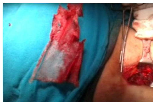
Fig4. Expanded Mesh

The patient was followed with daily dressings with I/V antibiotics followed by long term oral antibiotics. The overall healing was slow and it took 4 months for the wound to heal completely. At the end, there was no residual sinus. There was no recurrence till 1 year of the procedure.