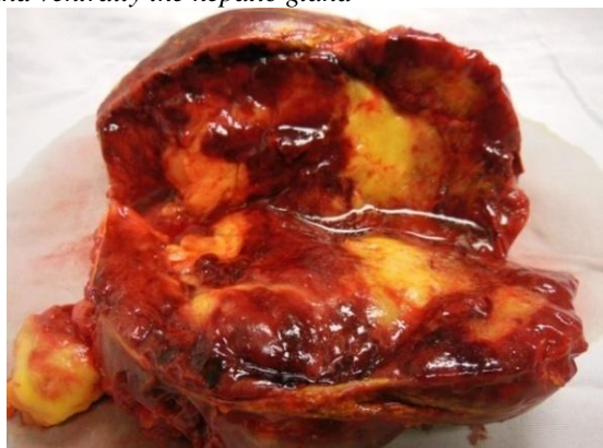
Fig2. Myelolipoma after longitudinal section showing areas of fat alternated with hemorrhagic ones.