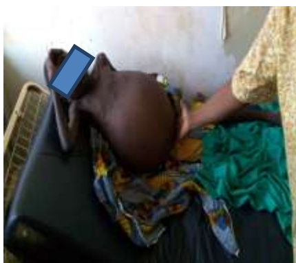
Picture 2 is showing gross ascites Manifested by liver cancer. Manifested by liver cancer.