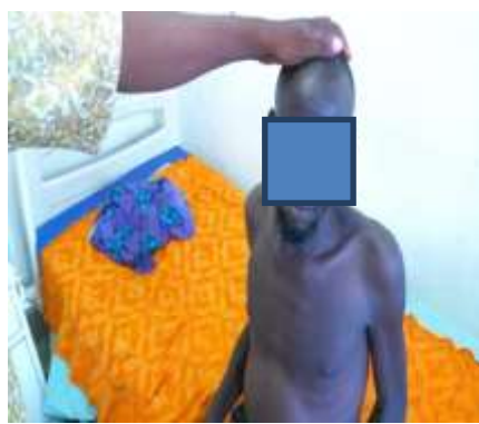
Picture1 is showing is showing jaundice