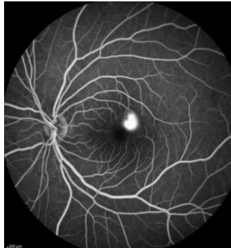
Figure2. Corresponding FFA showing Inkblot pattern