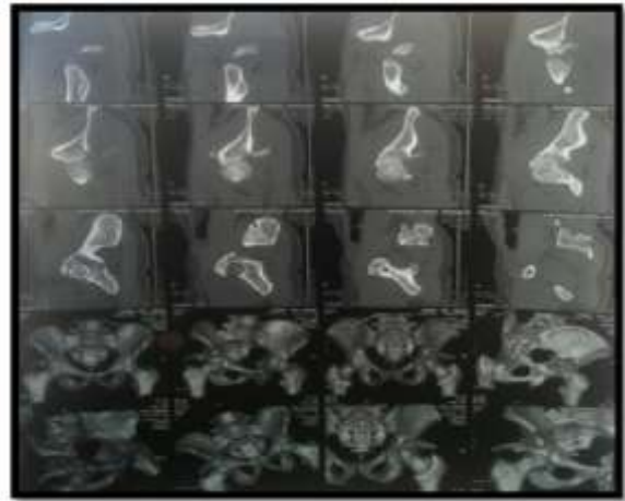
Fig. 1b. CT showing posterior wall acetabular fracture