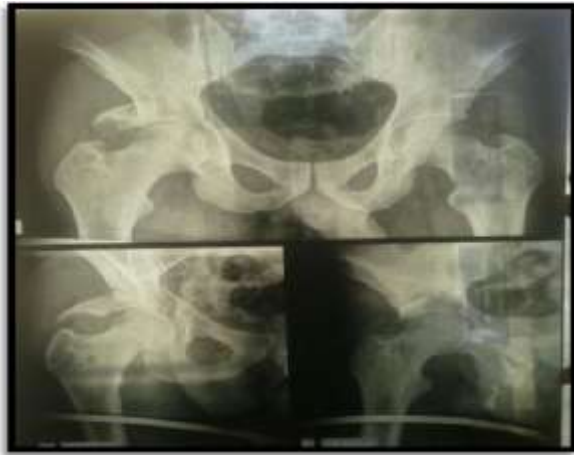
Fig. 1a. X- ray AP view of the pelvis showing fracture posterior wall of acetabulum

radiological images of two cases were presented in figures 1 and 2.