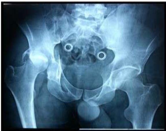
Fig. 2a. Oblique view showing posterior acetabular fragment with instability of hip joint