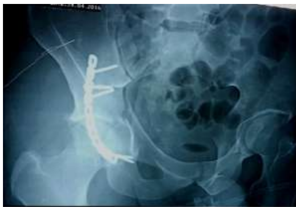
Fig. 2c. Postoperative oblique view showing good reduction