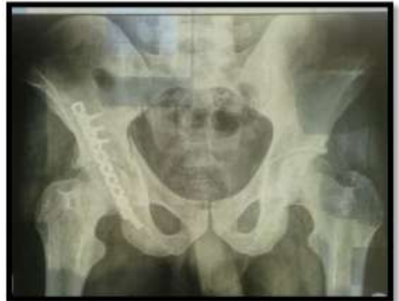
Fig. 1d. 12 months postoperative showing complete union