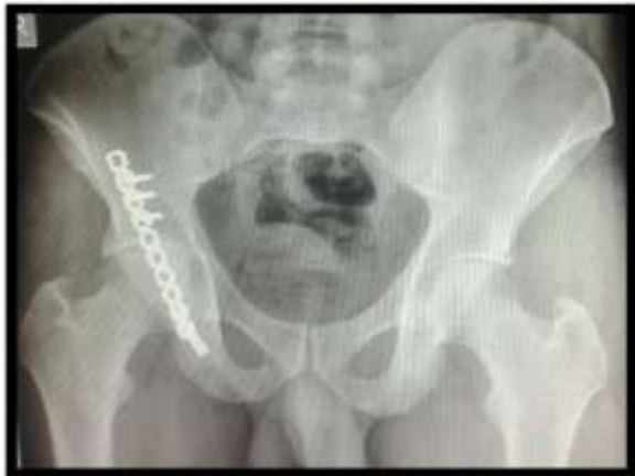
Fig. 1c. Immediate postoperative x ray showing fixation of the posterior wall with reconstruction plate and cancellous screws