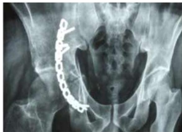
Fig. 2d. 4 months postoperative showing fracture healing