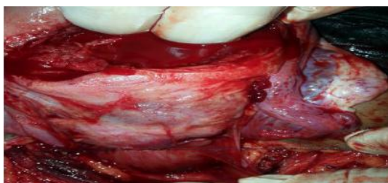
Figure1. Demonstration of first transverse suture of N&H technique

The uterus with the placenta inside was exteriorized quickly after extraction of the fetus while it was still not contracted to facilitate its exteriorization through the abdominal incision. The uterus (including placenta) is exteriorized and compressed against the symphysis pubis by assistant to minimize blood loss by direct pressure and kink of uterine vessels. The uterine artery was ligated bilaterally; then, the placenta was separated. Hemostatic sutures were applied in the uterine wall to control bleeding from the placental bed as much as possible.