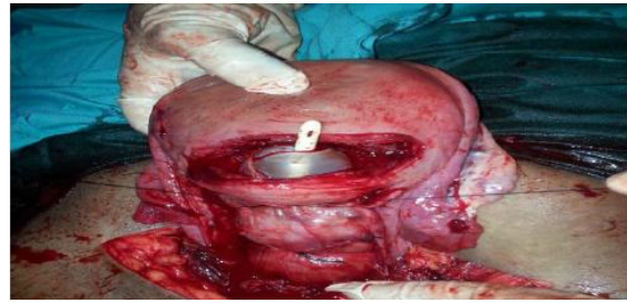
Figure2. Demonstration of second transverse suture of N&H technique