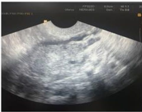
Fig1. Transvaginal grey-scale ultrasonography image of complex echoic mass with numerous irregular, tubular, anechoic structures in uterus