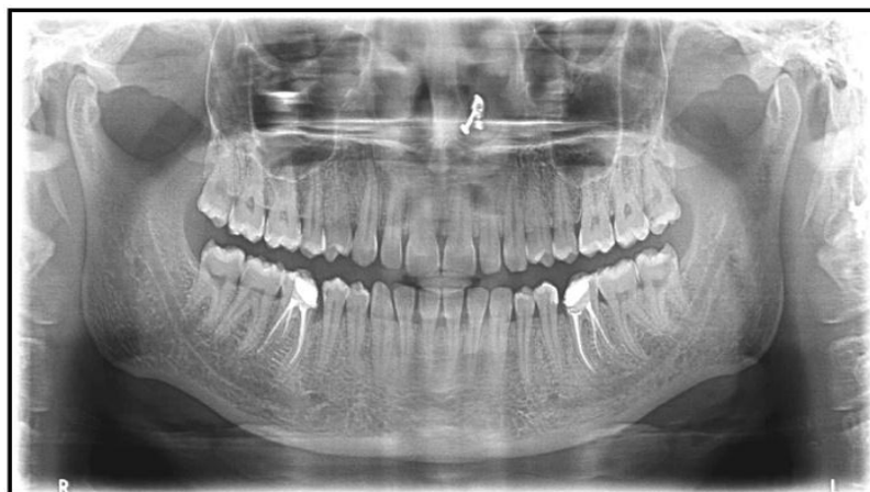
Figure4. Post Obturation OPG Showing Bilateral Radix Entomolaris