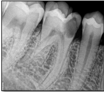
Figure 2 A