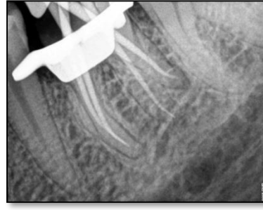
Figure 1 B