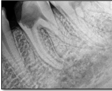
Figure 1 A