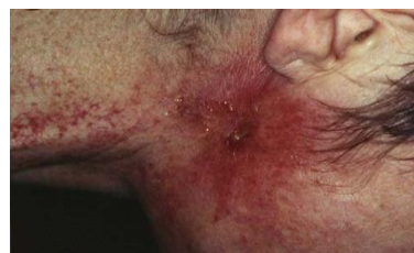
Figure2. Initial clinical signs of skin breakdown