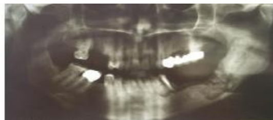
Figure5. Moth Eaten Appearance with Pathological Fracture

CT, CBCT, MRI are the more advanced diagnostic modalities available.