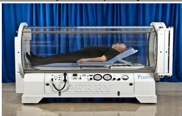
Figure6. Hyperbaric oxygen therapy in Osteoradionecrosis