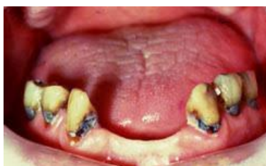
Figure4. Radiation Caries