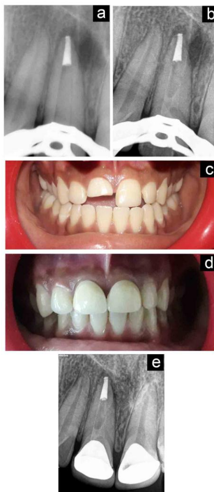
Figure2. (a) Radiograph of dentine post try in. (b) Radiograph after post cementation. (c) Pre-operative clinical photograph. (d) Post operative clinical photograph. (e) One year follow up radiograph