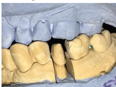
Figure2. Assessment of tooth preparation - occlusal view, with antagonist