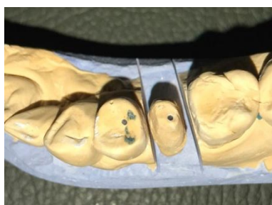
Figure1. Assessment of tooth preparation - occlusal view, without antagonist