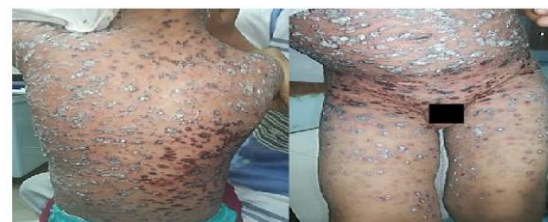
Figure1: Reddish brown crusted and psoriasiform papules and plaques disseminated over the trunk and lower extremities.

The patient was hospitalized. Extensive laboratory investigations revealed microcytic hypochromic anaemia (7.5 mg/dl), hypoproteinemia, hypoalbuminemia and raised C-reactive protein (CRP). Also, erythrocyte sedimentation rate (ESR) was high. Blood culture revealed staph aureus, which was indicative of sepsis required starting intravenous antibiotics.