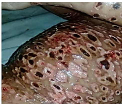
Figure3: Improved skin condition with depressed scarring.

Febrile ulceronecrotic Mucha-Habermann disease (FUMHD) is a rare presentation of