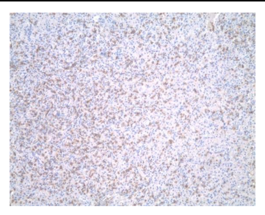
Figure 7. Immunohistochemical examination, immunoreactivity for DAB 44 in splenic hairy cell infiltrate