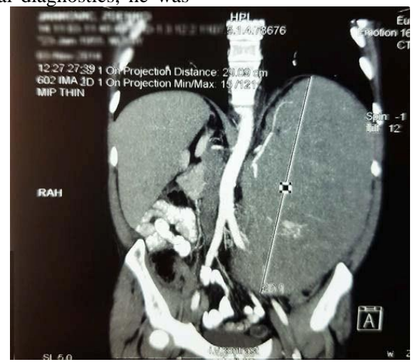
Figure 1. Preoperative imaging (CT), Craniocaudal diameter of the spleen

transferred to the Clinic for Hematology where he was diagnosed with Hairy Cell Leukemia and ordinated with chemotherapy (Cladribine). After 6 months, a control biopsy of the bone marrow showed a significant reduction in bone marrow infiltration from 40% to 10%. In July 2015, he another cycle of the (Cladribine) chemotherapy. The bone marrow biopsy in january 2016 detected a complete haematological remission of the disease in a bone marrow, but there was still a splenomegaly with expressed symptoms. The value of the platelets at the admission to our Clinic were 38x10^9/L . Computerized tomography (CT) confirmed the previous finding of splenomegaly. The length of the spleen in the cranial - caudal direction (longitudinal diameter) was 29.09 cm (Figure 1), while its transversal diameter was 21.81 cm (Figure 2). Due to the existence of a massive splenomegaly (> 20 cm in the cranial - caudal direction) we decided for the classic splenectomy. After surgery, the weight of the spleen was 1950 gr. The macroscopic preparation of the spleen was largely covered with a lightcolored hyaline capsule with a thickness of 5-15 mm (Figure 3).