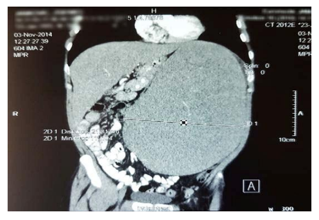
Figure 2. Preoperative imaging (CT), transfersal diametar of the spleen