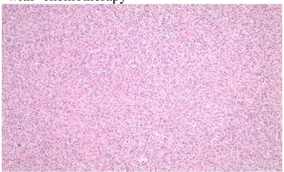
Figure 4. The infiltrates are confined to the red pulp

(Cladribin). The infiltrates are confined to the red pulp (Figure 4). And Hyaline perisplenitis known as "icing sugar spleen" with capsule thickening ranging 5 to 15mm in this patient. Hairy cell infiltrate and blood lakes are seen in splenic parenchyma (Figure 5).